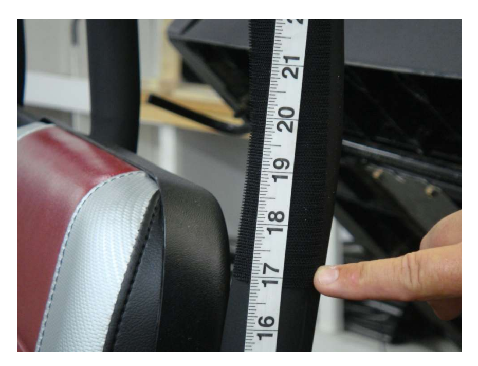
Figure 3.1 attach 8" Velcro strips vertically on the Rear Roll Bar uprights

Step 3: Remove the clear plastic backing from the 8 " Velcro strips and install vertically on the center of the Rear Roll Bar Uprights 17" above the bottom of the Roll Bar as shown in figure 3.1. Note Velcro Strips should face away from the center of the cab.