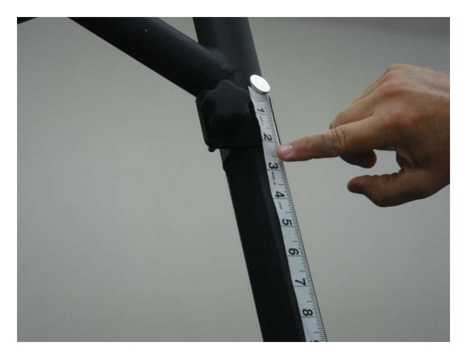
Figure 6.1 - install 10 " Velcro strips vertically along the Top of the front windshield Roll Bar upright

Step 6: Remove the clear plastic backing from the 10 " Velcro strips and install vertically along the upper and middle section of the Front Windshield Roll Bar uprights and install the 5" Velcro strips vertically along the bottom section of the Front Windshield Roll Bar uprights as shown in figure 6.1, figure 6.2 and Figure 6.3.