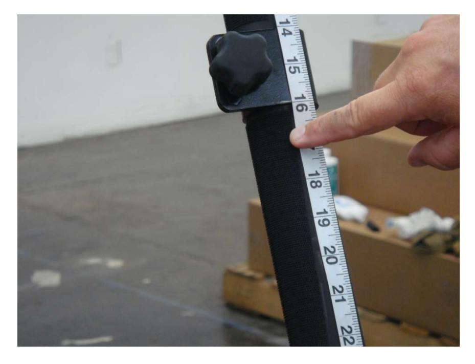
Figure 6.2 - install 10" Velcro strips vertically along the middle of the front windshield Roll Bar upright