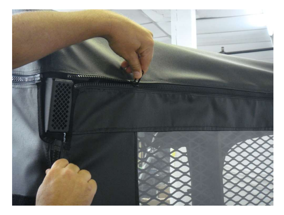
Figure 12.1 - attach Rear Panel onto Top Cap panel by Zipping the panels together