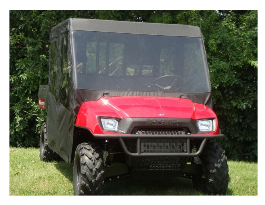
Figure 17.1 - Enclosure and Polycarbonate should fit as shown

Step 17: Repeat Steps as necessary until the Enclosure fits snuggly as shown in figure 17.1.