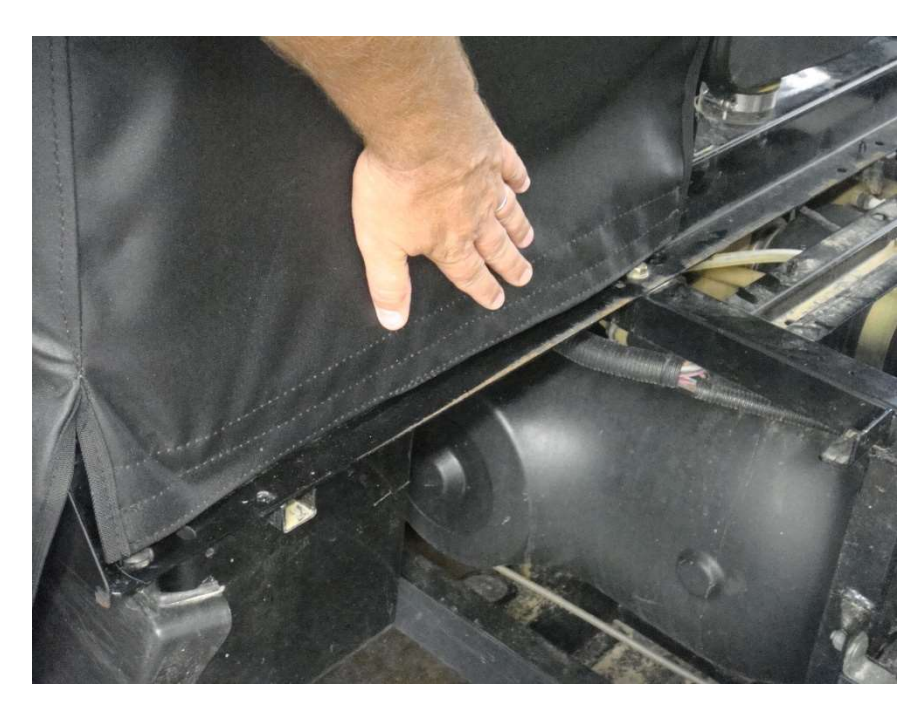
Figure 12.2 – Square Enclosure to Rear of Cab Frame and press Enclosure Velcro Tab onto 59" installed Velcro Strip