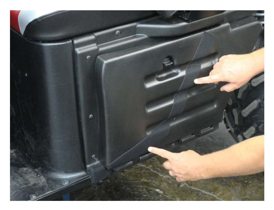
Figure 8.1 - Install 19.5" Velcro Strips on the Rear Door Side Panel

Step 8: Remove the clear plastic backing from the 19.5" Velcro strips and adhere to the Lower Rear Door Side Panel as shown in figure 8.1. Note: you will need to split the Velcro strips to fit in the troughs and to form the angle of the molded Rear Door Side Panel.