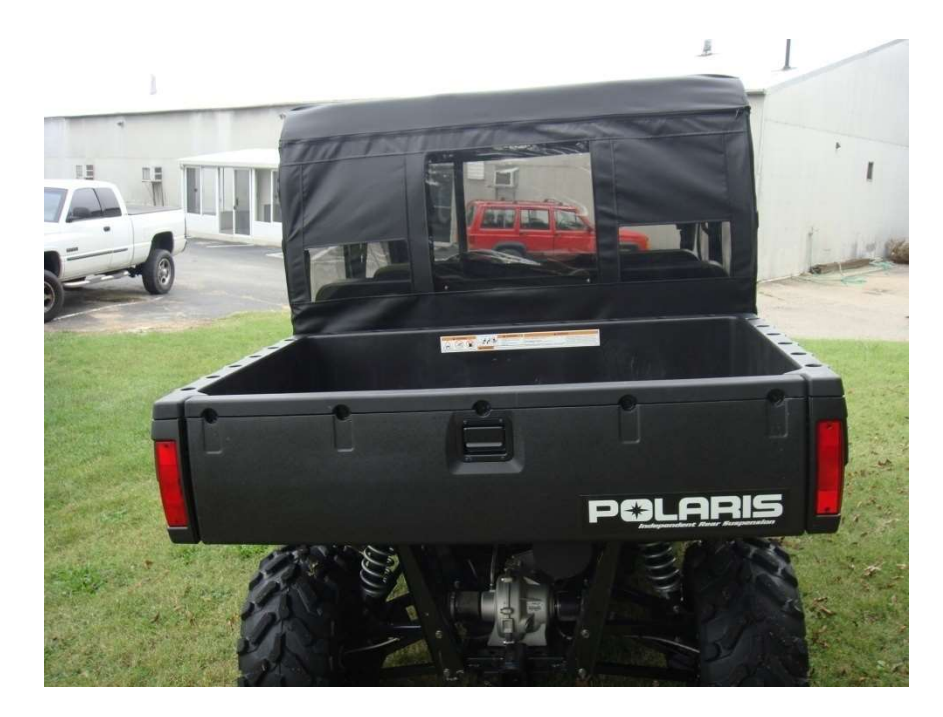
Figure 14.2 – Rear Panel should fit tightly across the back of the vehicle