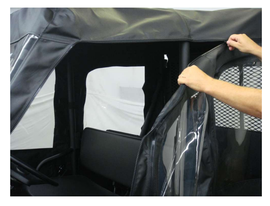
Figure 15.1 - Attach Side Door Panels by zipping them to the Top Cap