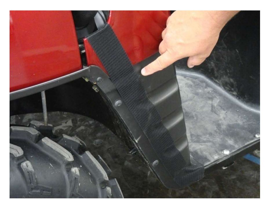
Figure 7.1 – attach 19" Velcro strips Vertically to the lower section of the Dash Cowl side panel and 4" strips horizontally at the bottom

Step 7: Remove the clear plastic backing from the 19 " Velcro strips and adhere to the lower section of the Dash Cowl Side Panel vertically and adhere the 4 " Velcro strips horizontally just below along the Rocker Panel as shown in figure 7.1.