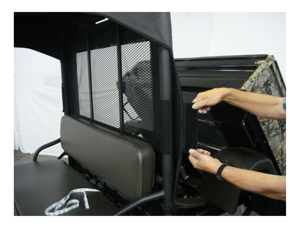
Figure 12.3 – attach 8" Rear Panel Roll Bar upright tabs to installed Velcro Strips

Step 13: Pull the two front sections of the Top Cap (each side of the front windshield) downward toward the front of the vehicle and attach the 10" and 5" Enclosure Velcro Tabs to the installed Front Windshield Roll Bar Post Velcro strips as shown in figure 13.1. This Step is best performed with an assistant attaching the Windshield Velcro Tabs on each side of the Windshield at the same time. Also attach the 7" and 30" (1" wide) Front Hood Enclosure Velcro tabs underneath the Hood to the installed Velcro Strips. The Front of the vehicle Windshield should look like figure 13.2.