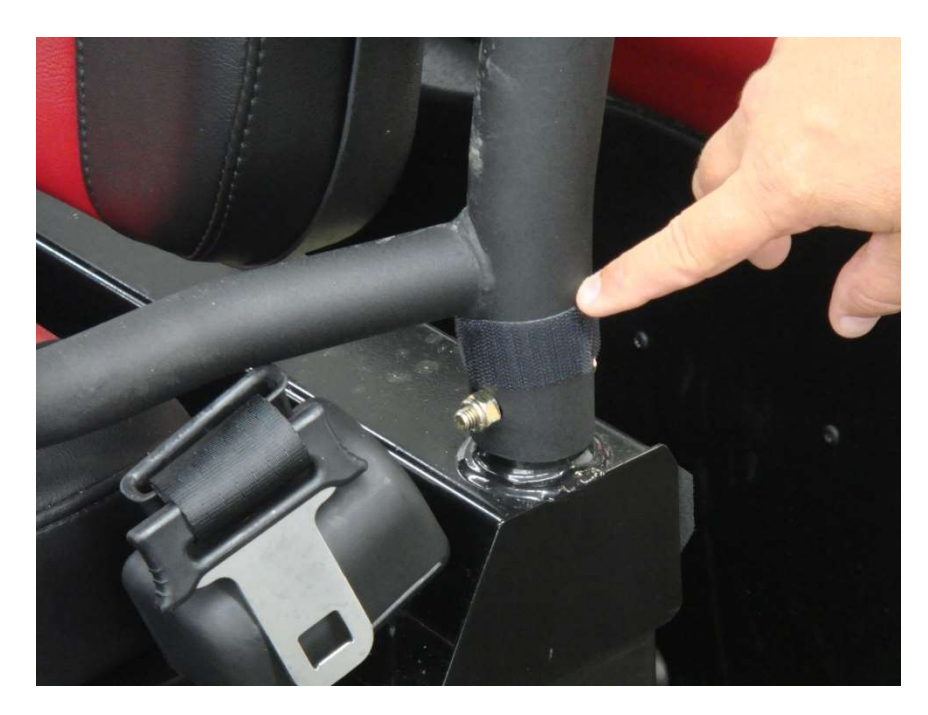
Figure 5.1 - install 6" (1" wide) Velcro strips horizontally around the bottom of the Center Roll Bar Uprights

Step 5: Remove the clear plastic backing from the 6 " (1"wide) Velcro strips and install horizontally around the Center Roll Bar Uprights at the bottom of the upright just above the bolt as shown in figure 5.1. Note Velcro Strip seams should face the center of the cab