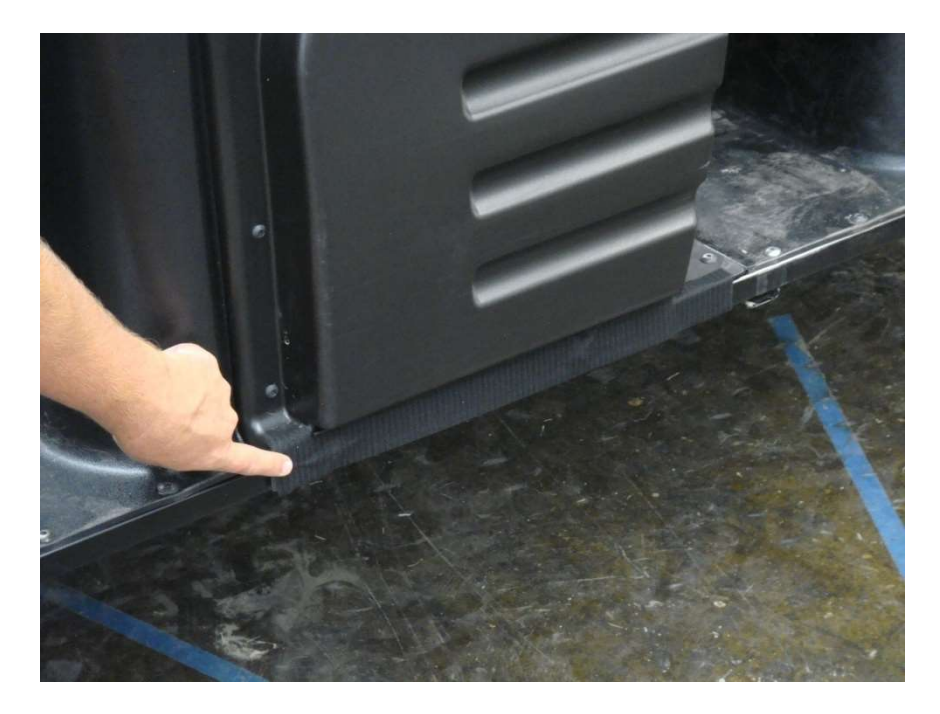
Figure 9.1 - attach 15" Velcro Strips to side Rocker Panels between the Front and Rear Doors

Step 9: Remove the clear plastic backing from the 15 " Velcro strips and adhere horizontally to the side Rocker Panel between the Front and Rear Door as shown in figure 9.1.