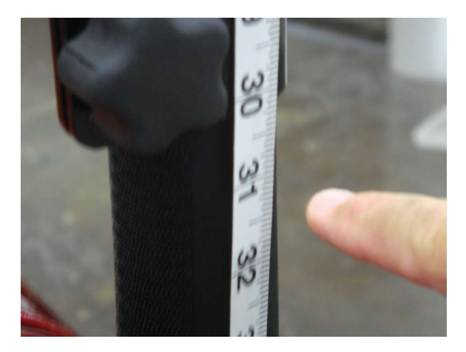
Figure 6.3 – install 5" Velcro strips vertically along the bottom of the Front Windshield Roll Bar uprights

Step 7: Remove the clear plastic backing from the 19 " Velcro strips and adhere to the lower section of the Dash Cowl Side Panel vertically and adhere the 4 " Velcro strips horizontally just below along the Rocker Panel as shown in figure 7.1.