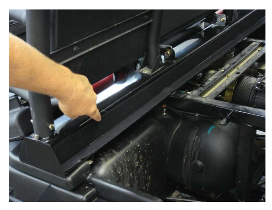
Figure 2.1 - attach 59" Velcro strip to Rear Cab Frame facing toward the rear of the vehicle

Step 2: Remove the clear plastic backing from the 59 " Velcro strip and install along the bottom of the Rear Cab Frame as shown in figure 2.1