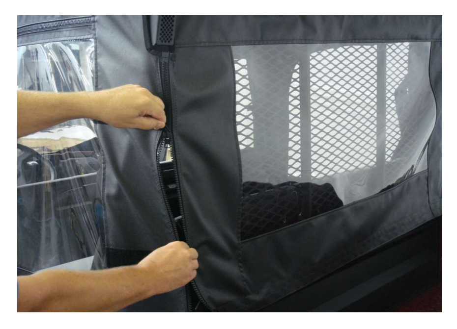
Figure 15.2 - attach Side Door Panels by Zipping them to the Rear Panel

Step 16: Attach remaining side Door Velcro tabs to installed Velcro strips at the following areas by pressing the Door Velcro Tab to the installed Velcro strips or wrapping the horizontal tabs around the Velcro strip / Roll Bar post as represented in figure 16.1: Note: lower door enclosure magnets will self attach once the Doors are aligned to Velcro strips.