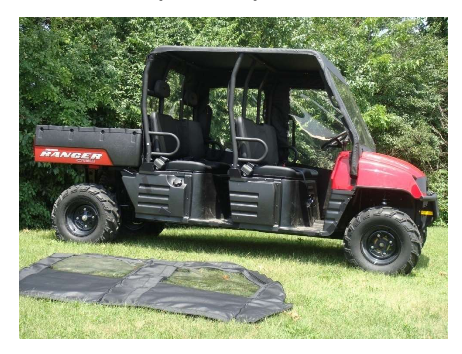
Figure 14.1 - Top Cap should fit snuggly along the vehicle Top Roll Bar Structure

Step 14: Repeat Steps 11, 12 and 13 until the Top Cap, Rear Panel and Windshield fit snuggly to the Vehicle Roll Bar structure as shown in figure 14.1 and figure 14.2