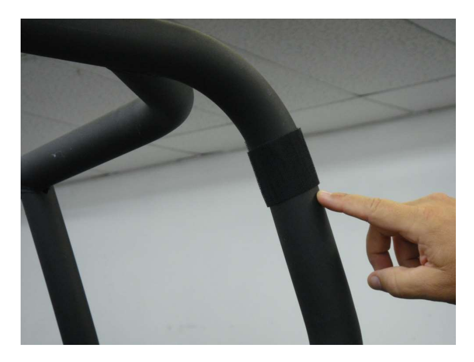
Figure 4.2 – install 6" Velcro strips horizontally around Rear Roll Bar Uprights

Step 5: Remove the clear plastic backing from the 6 " (1"wide) Velcro strips and install horizontally around the Center Roll Bar Uprights at the bottom of the upright just above the bolt as shown in figure 5.1. Note Velcro Strip seams should face the center of the cab