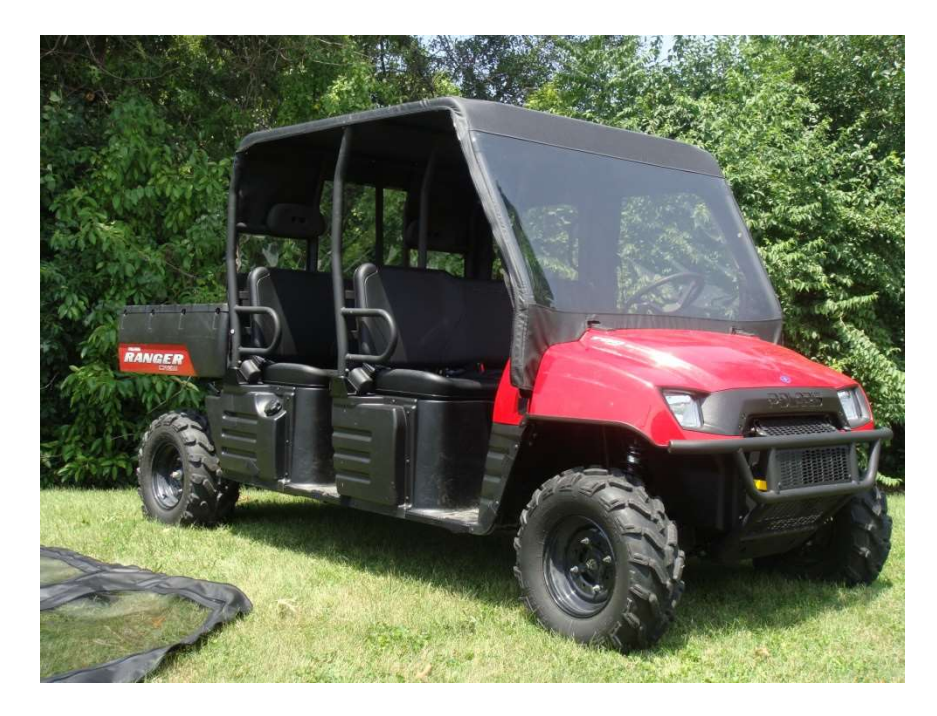
Figure 13.2 – Windshield should be tight at this step of the installation

Step 14: Repeat Steps 11, 12 and 13 until the Top Cap, Rear Panel and Windshield fit snuggly to the Vehicle Roll Bar structure as shown in figure 14.1 and figure 14.2