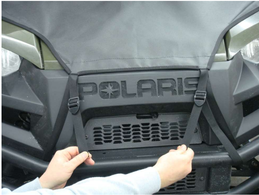
Figure 5.3 – Tighten Hood Straps by pulling down on the strap below the buckle

Step 6: Repeat any steps necessary to achieve a snug fit on the cab frame.