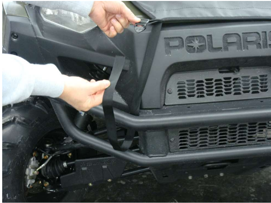
Figure 5.1 – guide front Hood straps around bumper