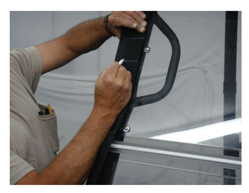
Mark windshield tabs where hard windshield clamps are located along the windshield Roll Bar