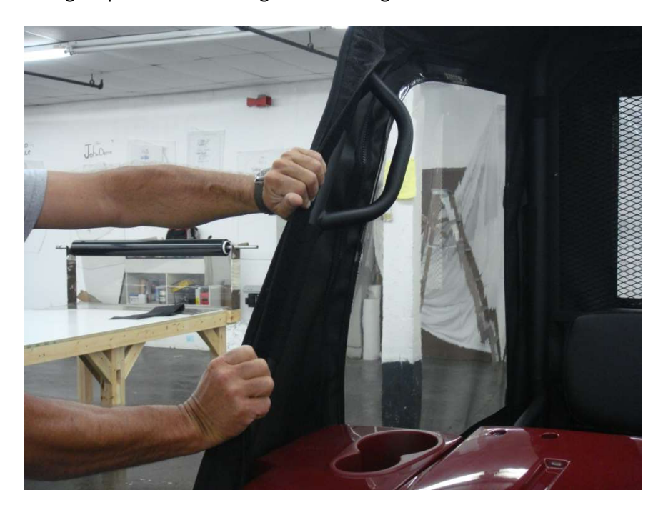
Step 10: The webbing/Velcro strip that runs the length of the front roll bars will need to be cut to accommodate the windshield clamps and the grab handle. With chalk, mark the webbing strip where cuts will be made. DO NOT CUT INTO THE BINDING.

Step 9: Pull the enclosure forward to the edge of the front roll bars. When installed properly, the binding between the canvas fabric and the webbing strip should rest along the outer edge of the windshield.