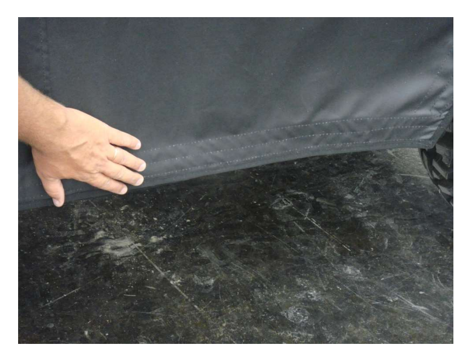
Attach Door Velcro Tabs

Step 14: Zip Doors closed and attach sewn-in Velcro to the attached adhesive Velcro.