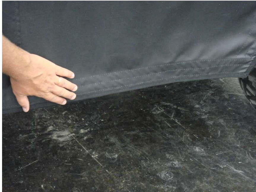
Attach Door Velcro Tabs

Step 14: Zip Doors closed and attach sewn-in Velcro to the attached adhesive Velcro.