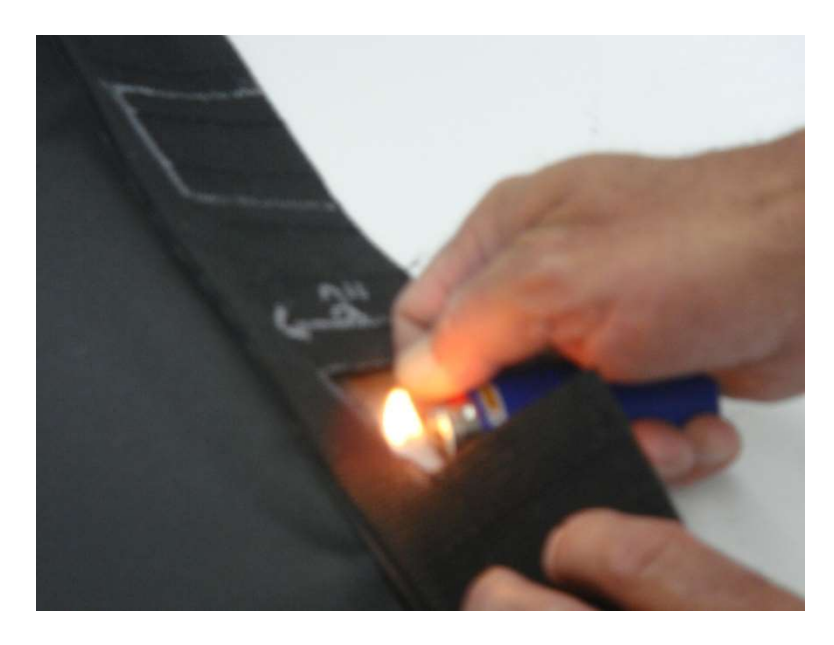
Figure 7.3 - With a lighter briefly melt the frayed ends of the fabric to prevent future fraying of the material

Step 8: Repeat all steps necessary to align the cab for a snug and smooth fit on the cab frame.