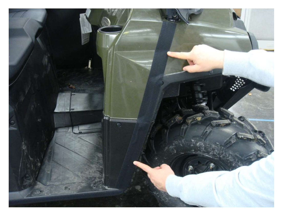
Attach 28 1/2" Velcro strips vertically to the lower section of the Dash Cowl side panel