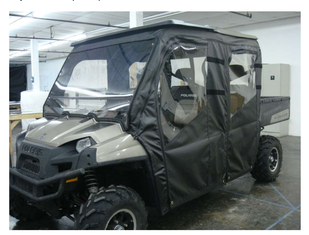
Step 9: Re-install your top and windshield.

See enclosed Product Care sheet for instructions on how to properly care for your 3SI UTV Enclosure.