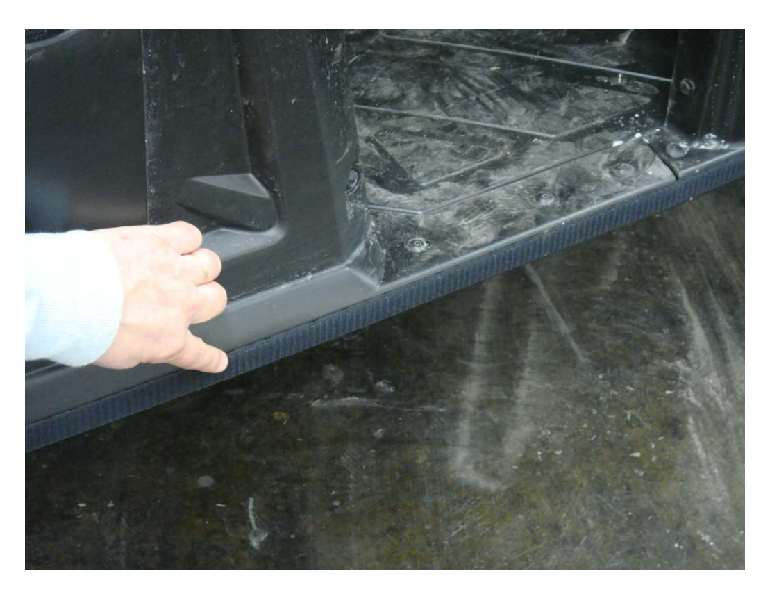
Attach 34 ½" Velcro Strips to the side Rocker Panel edge below the front doors and the 23 ½" Strips below the Rear Doors