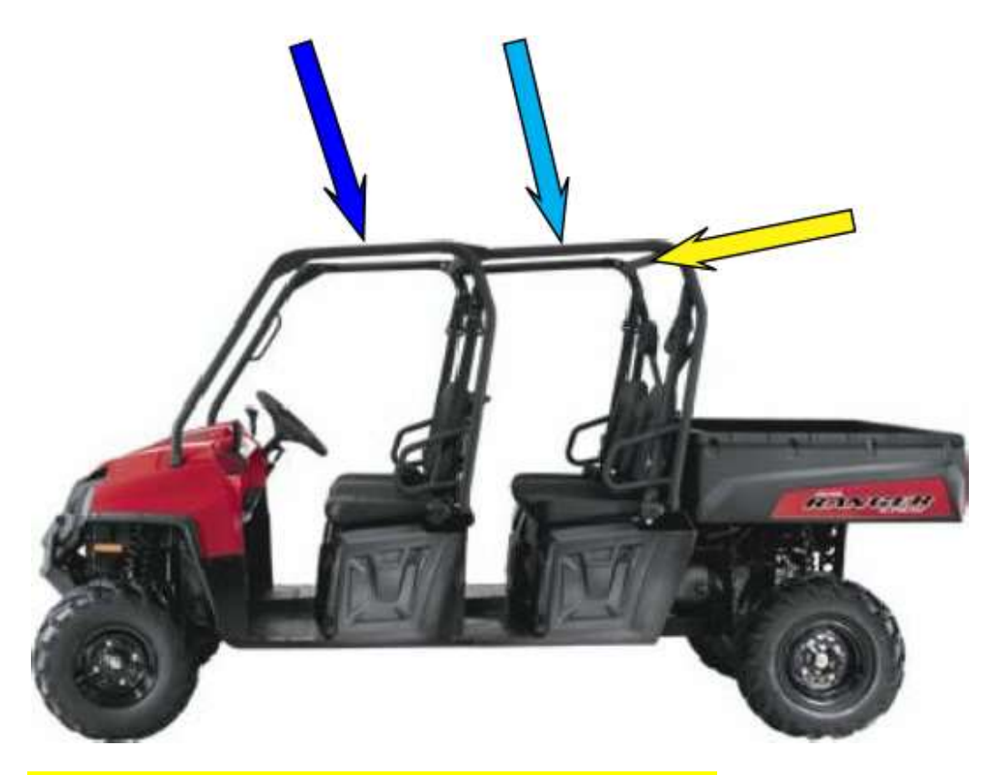
Attach 40" Velcro strip horizontally along the inside of the back support bar.

Attach 19" Velcro strips horizontally along the inside of the side support bar over the back seats.