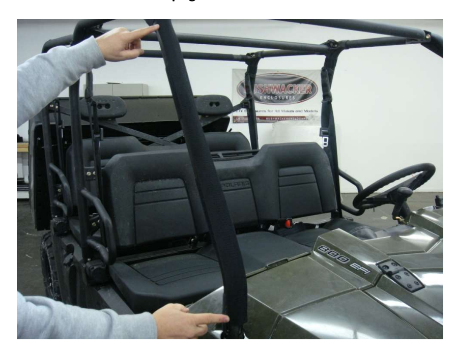
Step 6: Attach the door/rear window panels to the cab frame starting with the back panel. Adjust the Velcro connections and square the back panel as needed. Attach the side panels. Zip the side panels to the back panel. Adjust the Velcro connections on the side panels as needed.

Step 5: Before removing the backing on the 32" Velcro strips, cut the strips as needed to allow for clamp placement. Install the Velcro strips vertically along the front roll bar upright. Velcro Strips should be applied to the inside edge of the Windshield Roll Bar upright.