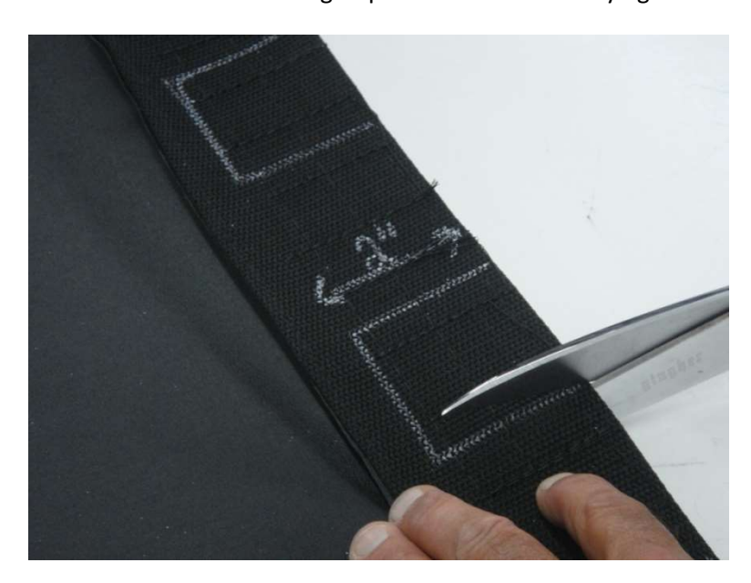
Figure 7.1Cut out Velcro Tab Binding at each Clamp Location

ATTACHING VELCRO TAB BINDING TO THE ENCLOSURE CANVAS MATERIAL . You will need to melt the frayed ends of the Velcro Tabs after cutting to prevent continued fraying as shown in figure 7.3.