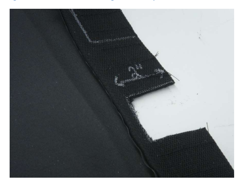
Figure 7.2-DO NOT CUT VELCRO TAB BINDING STITCHES ATTACHING BINDING TO THE ENCLOSURE – stay back at least ½" from Stitching while Cutting