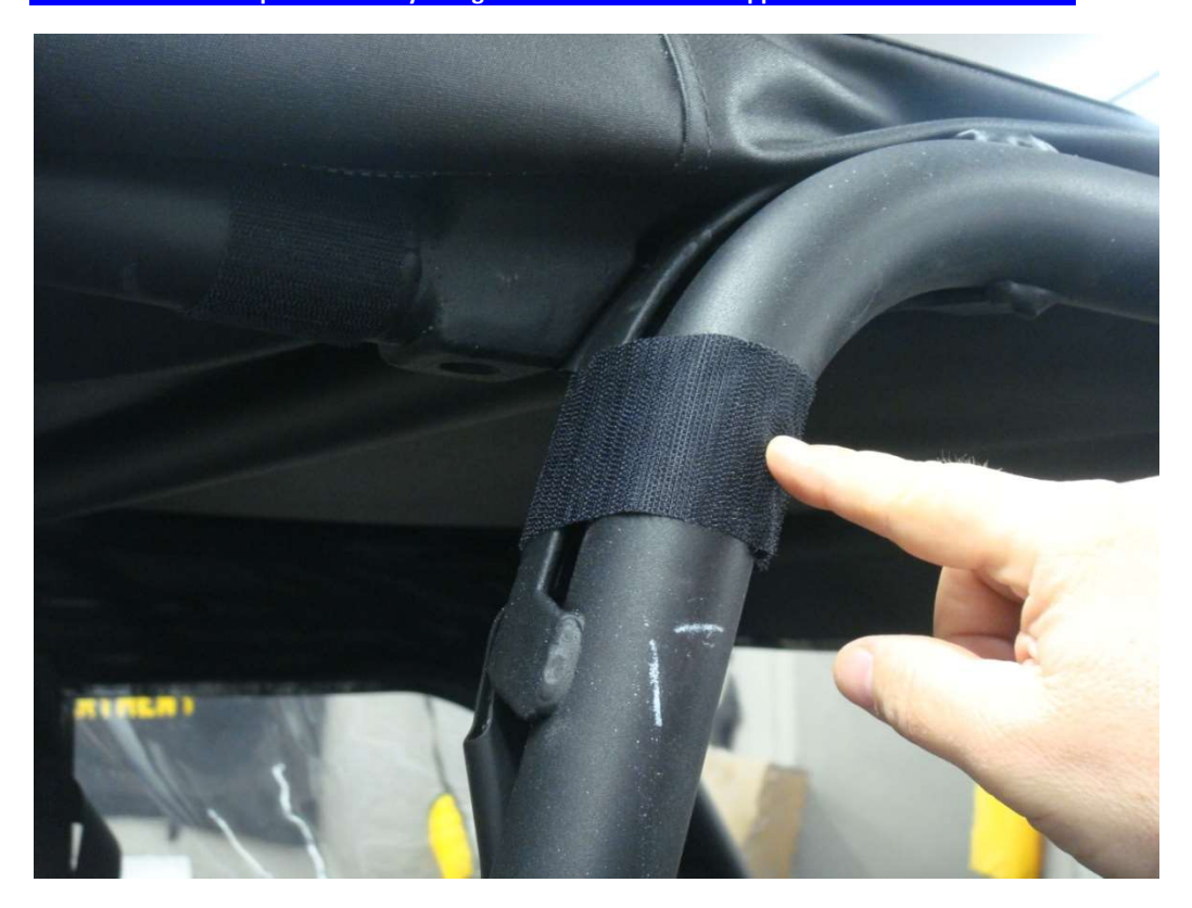
Wrap 9" velcro strips horizontally around the top of each roll bar upright.

Attach 14" Velcro strips horizontally along the inside of the side support bar over the front seats.