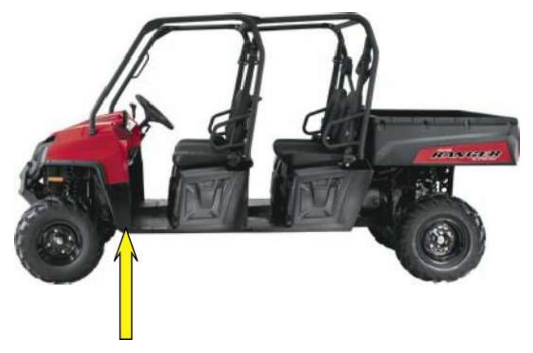
Attach 3 ½" Velcro Strips to the front edge of side Rocker Panels