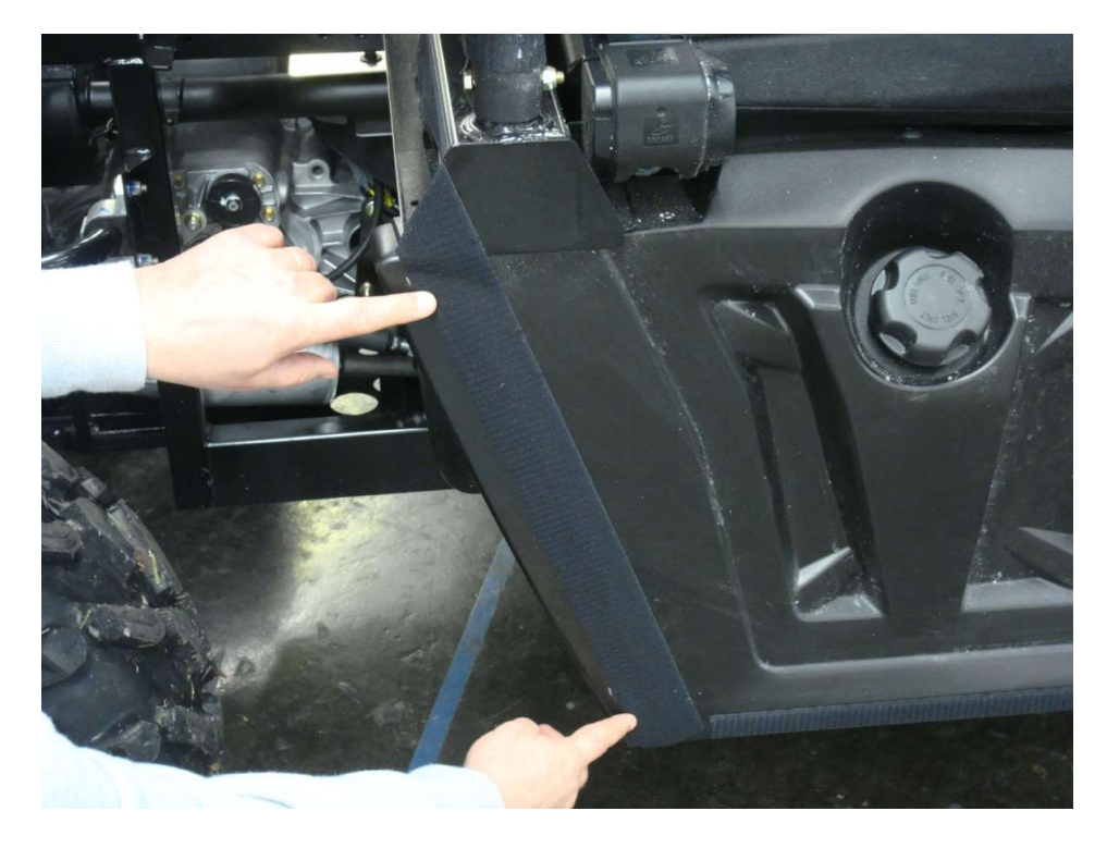
Install 18 1/2" Velcro Strips vertically on the Rear Door Side Panel

Step 5: Before removing the backing on the 32" Velcro strips, cut the strips as needed to allow for clamp placement. Install the Velcro strips vertically along the front roll bar upright. Velcro Strips should be applied to the inside edge of the Windshield Roll Bar upright.