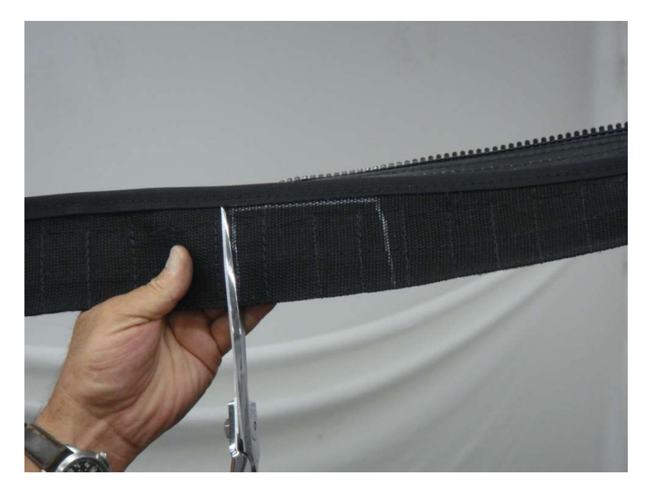
Cut the Tab being very careful not to cut the binding at the edge.