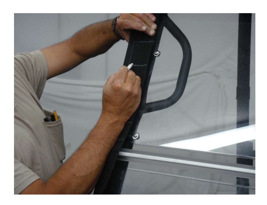
Step 7: Cut the webbing strip with household scissors. AGAIN, DO NOT CUT INTO THE BINDING. Seal the frayed edges with a lighter. Have a wet cloth handy to dab the edges if needed.