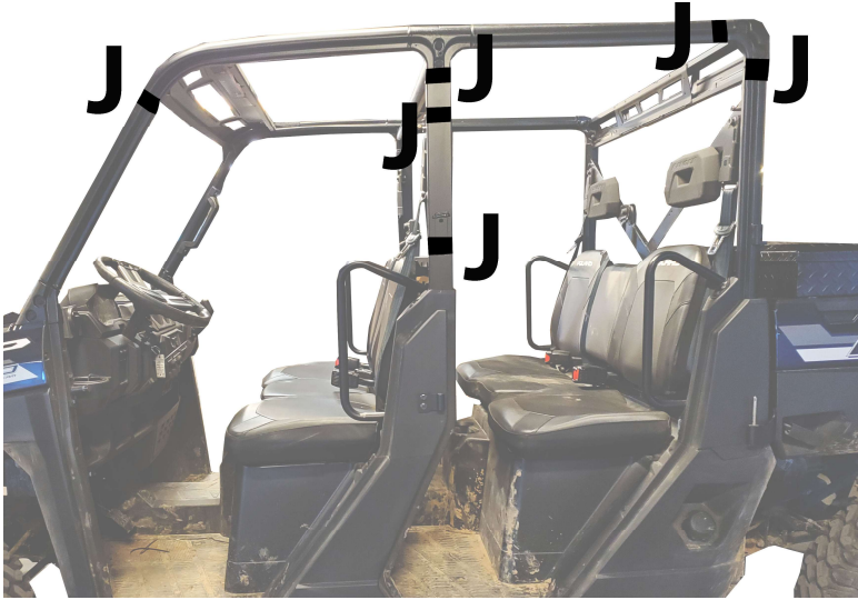
Figure 4: Wrap each adhesive strip J around the roll bar.