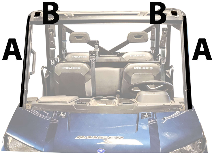
Figure 1: Place adhesive Velcro as shown in photo. This photo shows the placement of the 2" Velcro for Strips A.