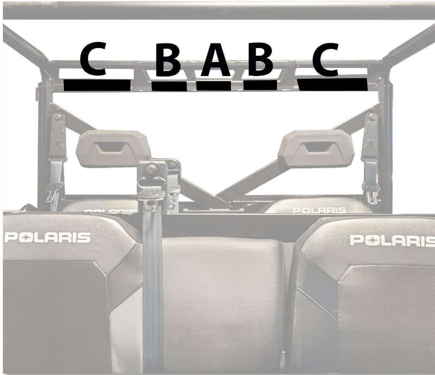
Figure 1: Align the top of the back panel up in the center of the roll bar. Wrap tabs through the openings in the top of the roll cage.