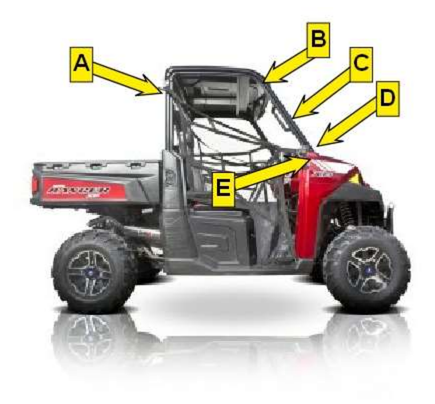
Step 5: After all adhesive hook is in place, attach the windshield/top to the cab frame. Attach the sewn in loop strips to the adhesive hook strips on the cab frame. Reposition and square to the frame as necessary.

Step 6: Fasten the front hood straps to the vehicle front bumper as shown below. Bringing the end of the straps up to the latch buckle, run the end through the back of the top buckle opening first and then through the front of the lower buckle opening as shown below. DO NOT FULLY TIGHTEN FRONT HOOD STRAPS AT THIS TIME.