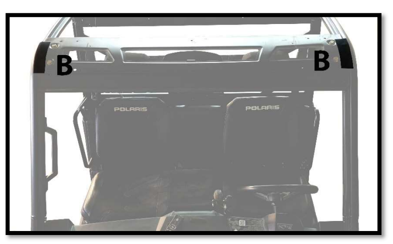
Figure 2: SHOWS PLACEMENT OF 6" VELCRO STRIPS (B)