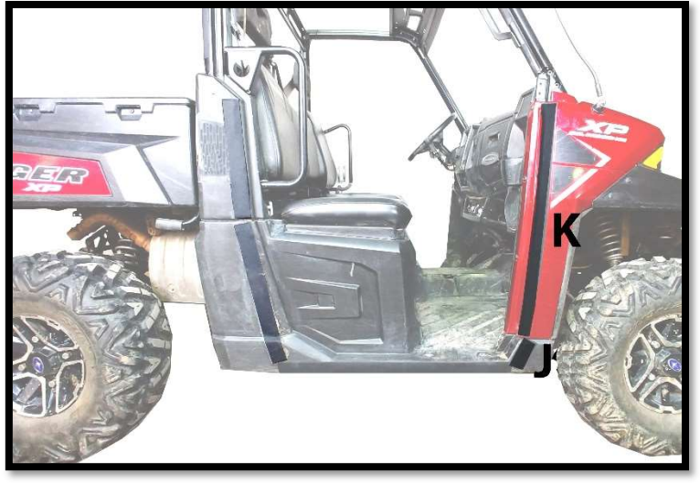
Figure 7: SHOWS PLACEMENT OF 4" AND 29" VELCRO STRIPS (J AND K)