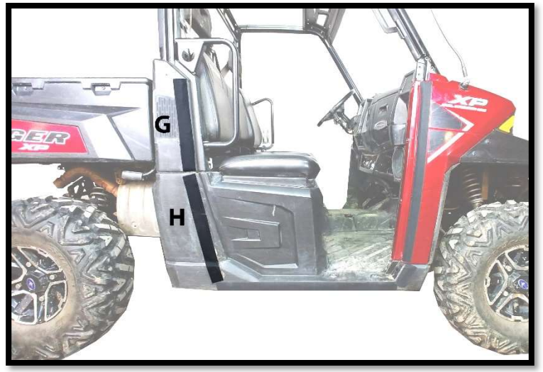
Figure 5: SHOWS PLACEMENT OF 14" AND 18" VELCRO STRIPS (G AND H)