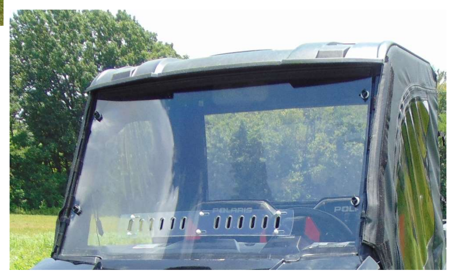
Figure 10: REINSTALL WINDSHIELD AND HARD TOP OVER THE DOOR KITS TABS AND STRAPS.