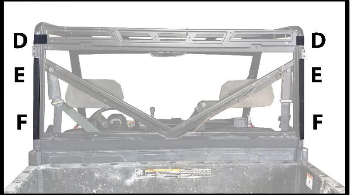
Figure 4: SHOWS PLACEMENT OF 4" AND 18" VELCRO STRIPS (D AND E) YOU CONNECT TABS E AND F TO THE 18" STRIP E.