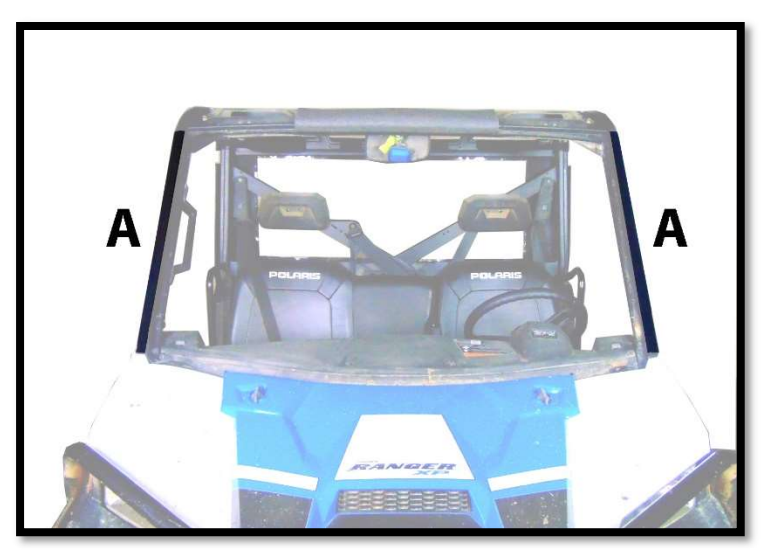
Figure 1: SHOWS PLACEMENT OF 26" VELCRO STRIPS (A) VELCRO STRAPS ON THE DOOR WILL WRAP AROUND ROLL-BAR AND CONNECT TO ADHESIVE VELCRO. You may move the straps around to avoid interference with other aftermarket products.