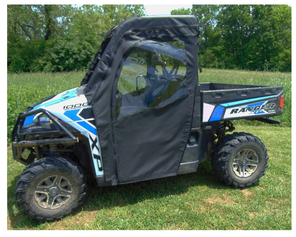
Figure 11: DOOR SHOULD RESEMBLE PHOTO WHEN INSTALLATION IS COMPLETE.