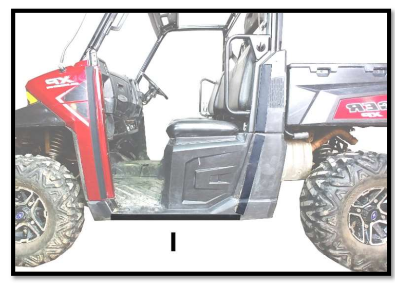
Figure 6: SHOWS PLACEMENT OF 29" VELCRO STRIP (I)