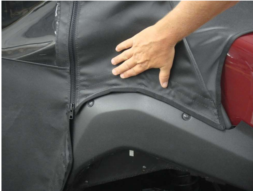
Attach Dash Cowl side Velcro Tabs