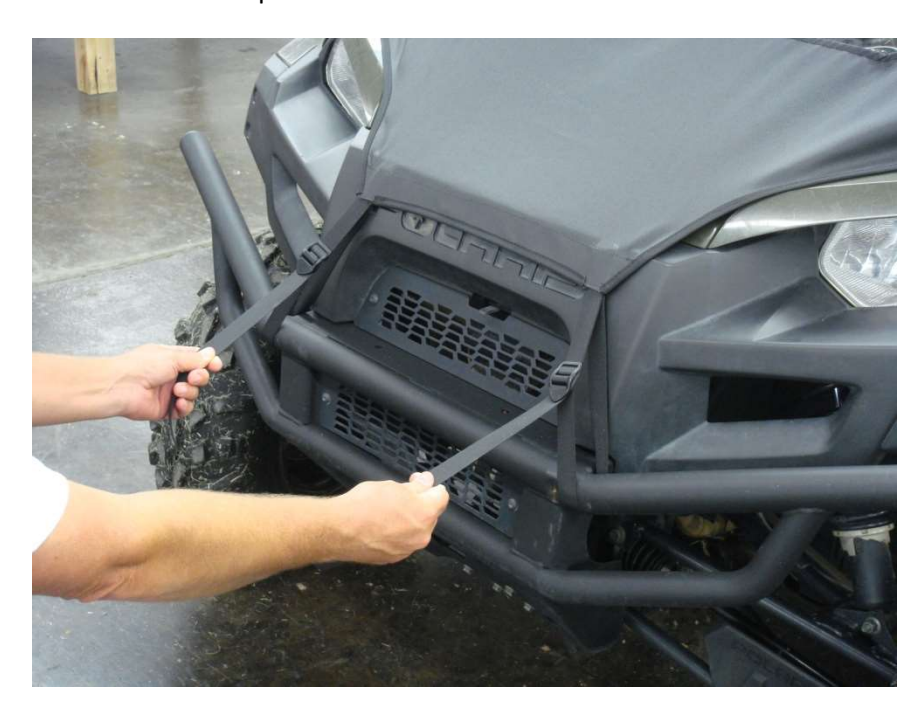
Step 9: Again, repeat any steps necessary to align and tighten the enclosure to the cab frame.