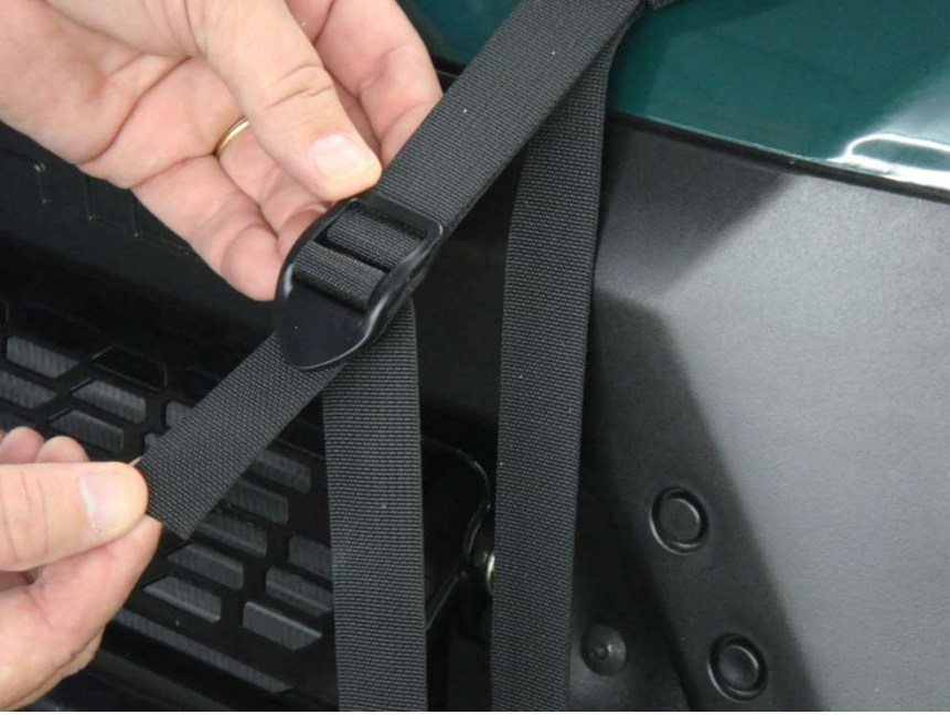
Step 7: Repeat all steps necessary to align and tighten the enclosure to the cab frame.