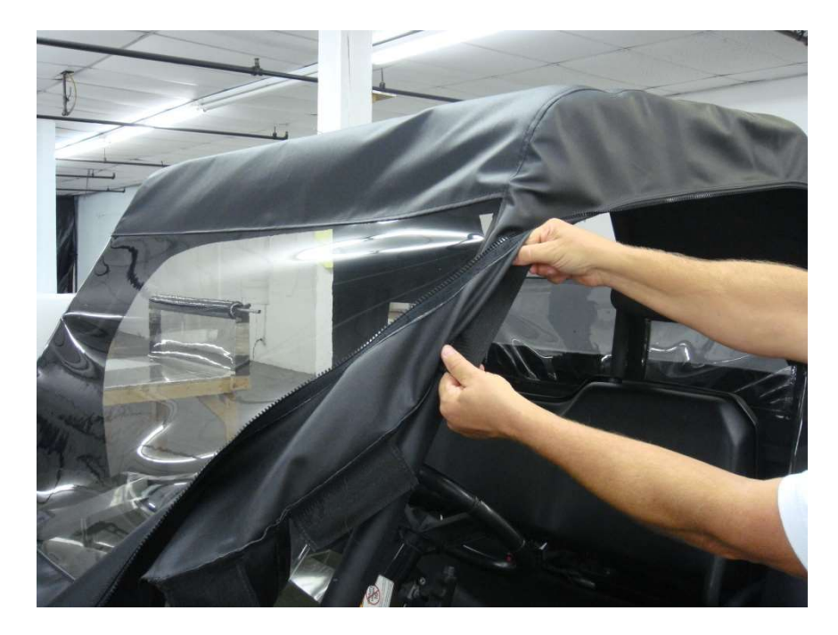
Attach tabs on either side of the windshield as shown above and below.