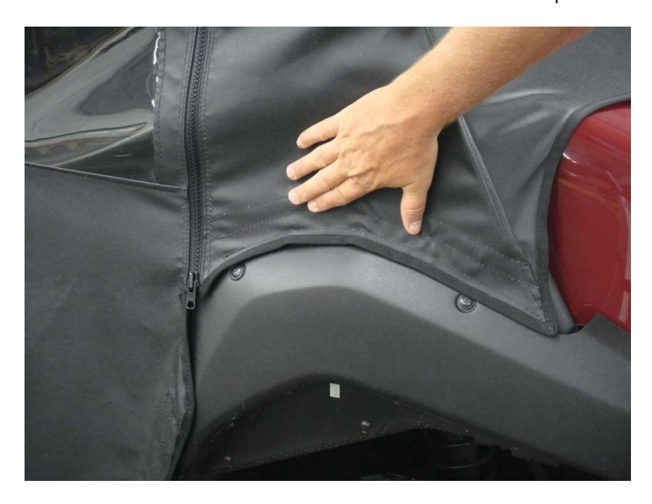
Attach Dash Cowl side Velcro Tabs