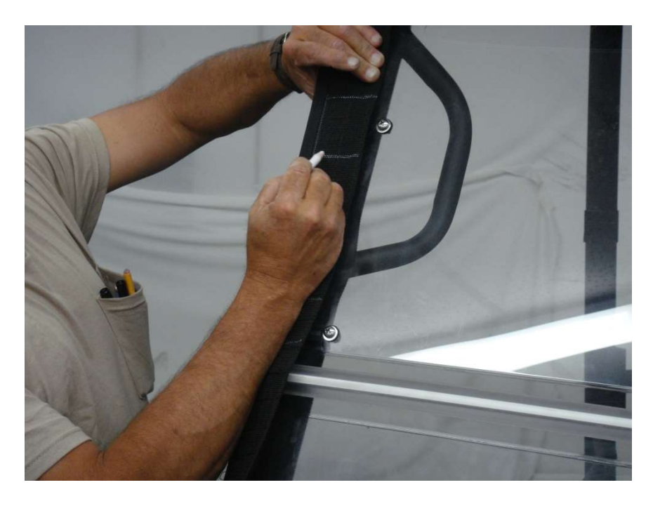
Mark windshield tabs where hard windshield clamps are located along the windshield Roll Bar