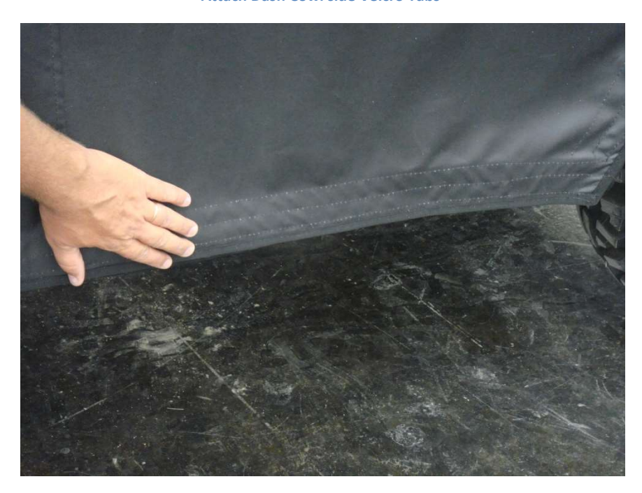
Attach Door Velcro Tabs