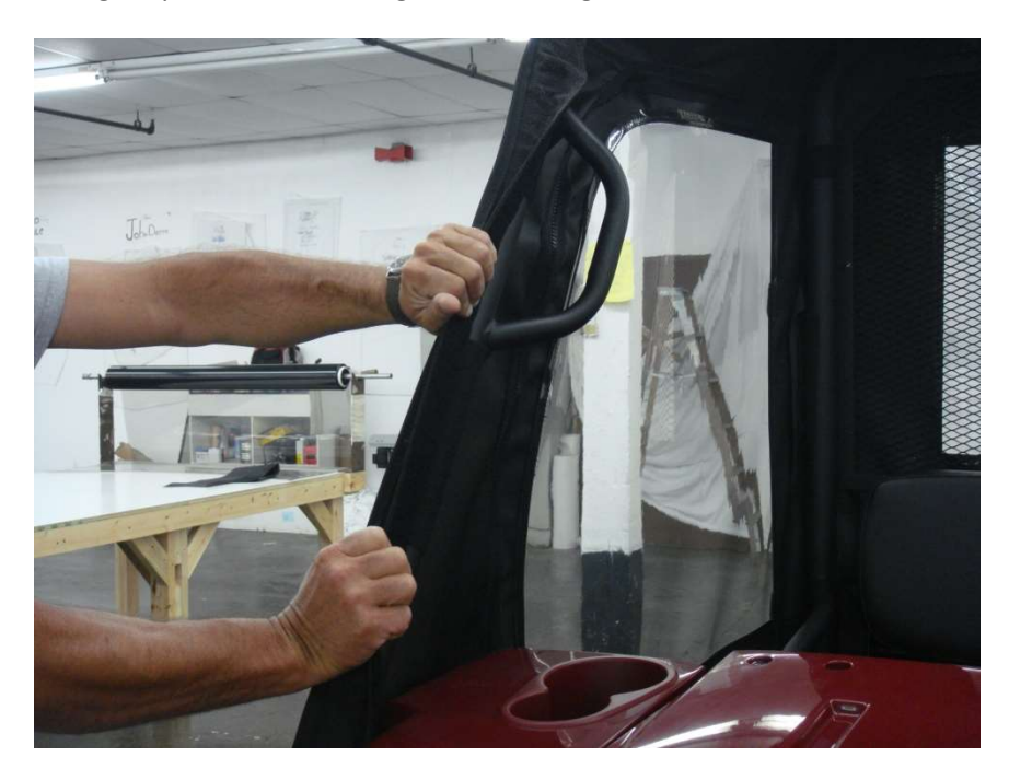
Step 7: The webbing/Velcro strip that runs the length of the front roll bars will need to be cut to accommodate the windshield clamps and the grab handle. With chalk, mark the webbing strip where cuts will be made. DO NOT CUT INTO THE BINDING.

Step 7: Pull the enclosure forward to the edge of the front roll bars. When installed properly, the binding between the canvas fabric and the webbing strip should rest along the outer edge of the windshield.