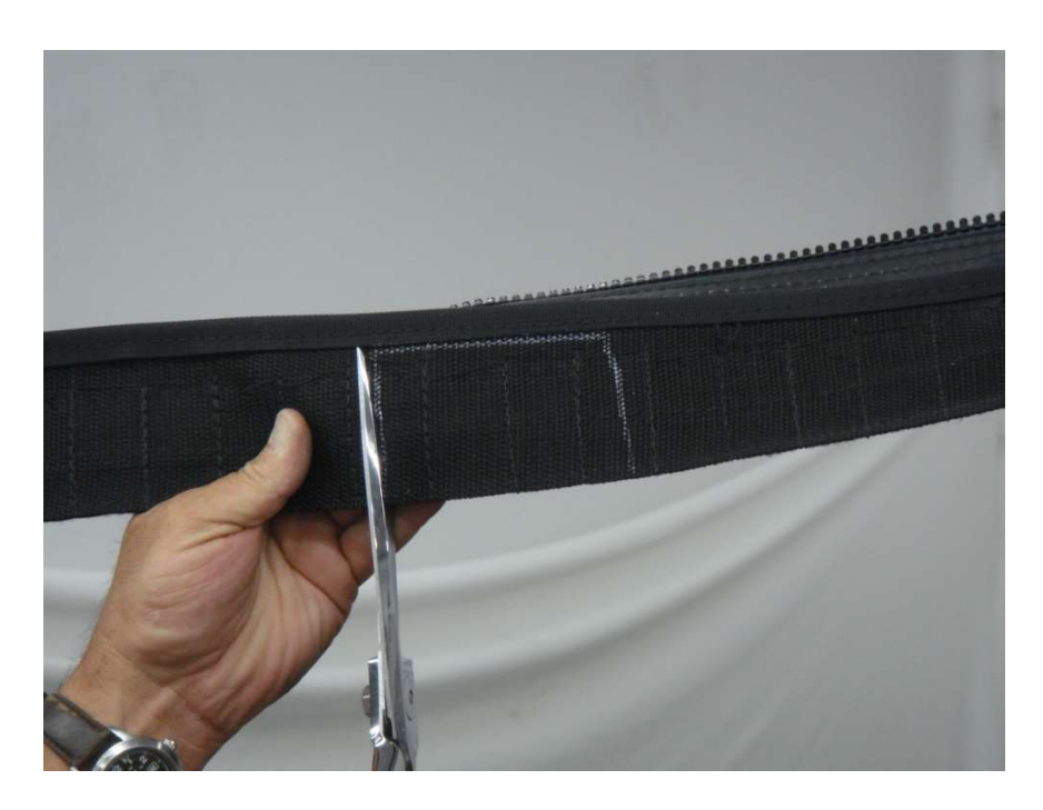
Cut the Tab being very careful not to cut the binding at the edge.