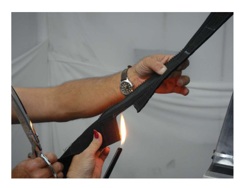
Figure 7.4 – Carefully burn the frayed thread around the cut area with a lighter.

Step 8: Zip Doors closed making sure the bottom door magnets attach to vehicle lower side Door Rocker Panel