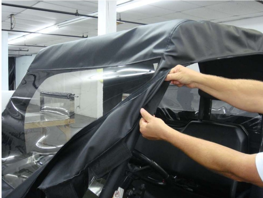
Attach tabs on either side of the windshield as shown above and below.

Step 6: Continue working forward by attaching each of the sewn-in Velcro loop strips to the attached adhesive Velcro hook strips. As you work forward, tighten the enclosure to the cab frame by pulling it forward, up and down. Adjust the enclosure as needed to align.