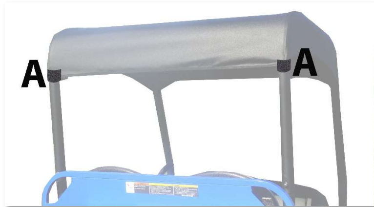
Figure 2: Wrap Velcro around the back roll bar.