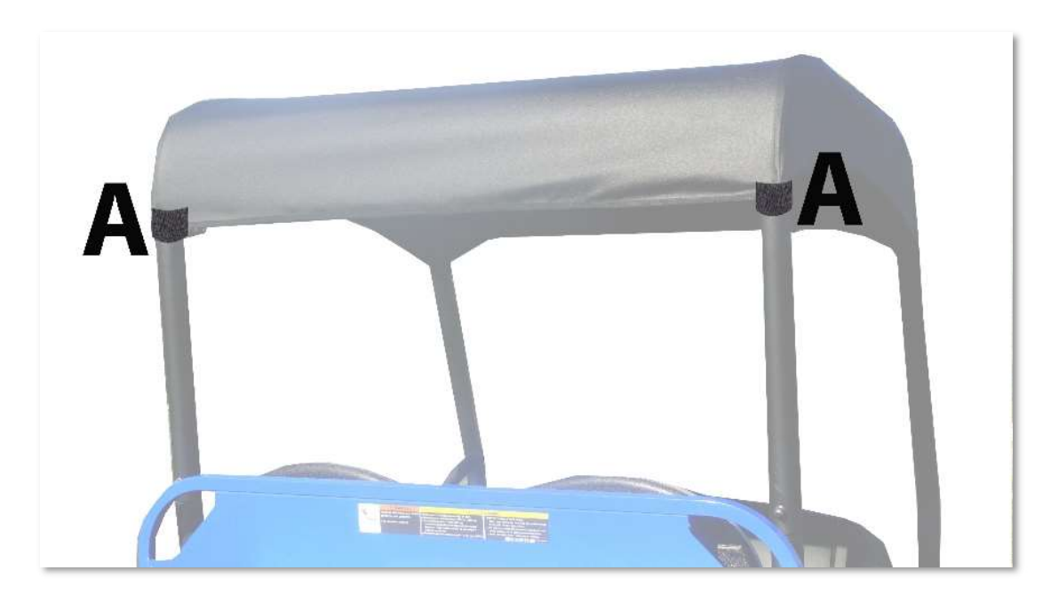
Figure 1: Wrap Velcro around the back roll bar.