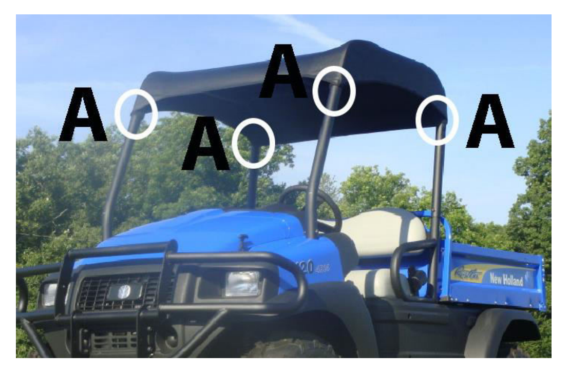
Figure 1: WRAP VELCRO STRIPS AROUND THE ROLL BAR AND ATTACH DOUBLE-SIDED STRAP.