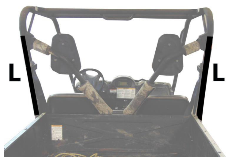
Figure 4: Shows placement of Velcro strips down the back of the roll bar. If you have a back panel the Velcro for this tab is sewn down the back of the back panel.