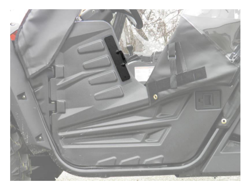
Figure 7: Metal plate has adhesive loop on the back that will attach the adhesive hook placed on the outside of the factory door.