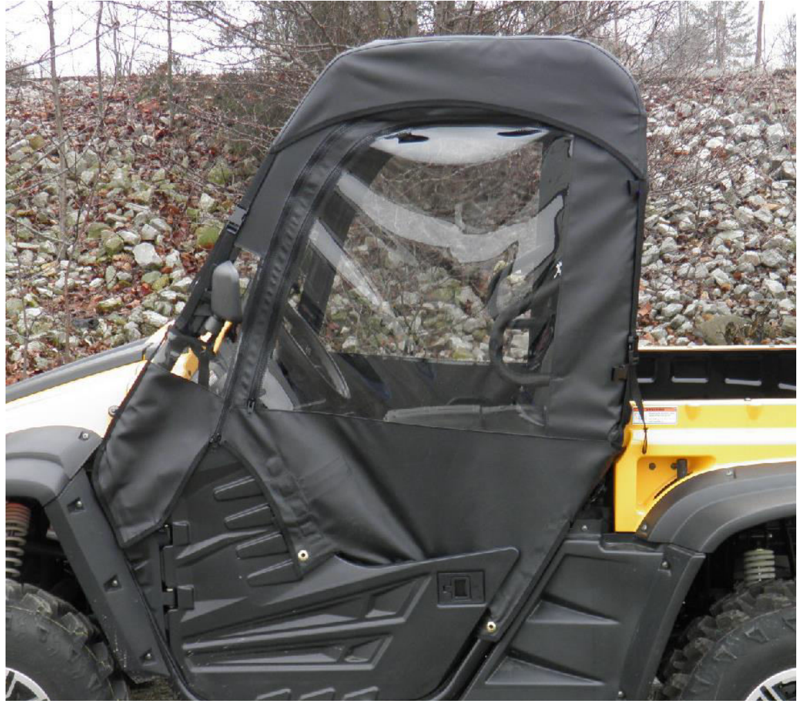
Figure 9: When the installation is complete your door kit should resemble the door kit in the photo.