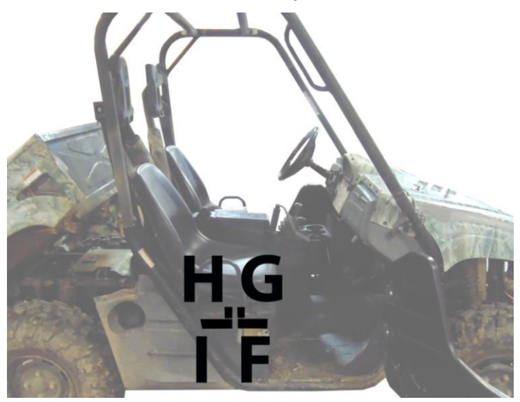
Figure 3: these strips are placed on the inside of the UTV.

Figure 1: Photo shows placement of adhesive Velcro. Strip E is for the metal plate included in you door kit. There are magnets sewn in to the door that will stick to the metal plate.