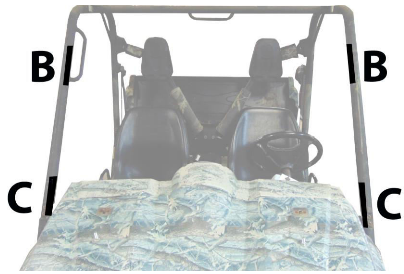
Figure 2: Place these strips more towards the inside of the roll bar. Tabs on the front of the door kit will wrap around the roll bar.