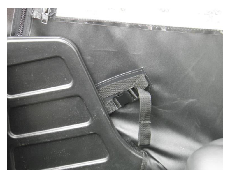
Figure 8: We have included a buckle that will secure the metal plate to the door. If the plate comes loose during use it will stay attached to the door.