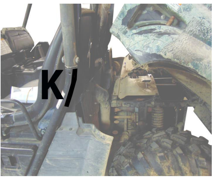
Figure 5: Raise the bed and attach to the bottom of the back roll bar.