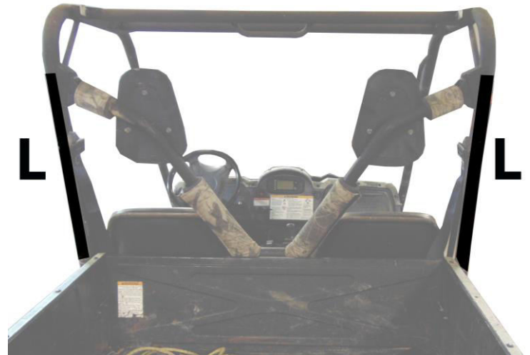
Figure 4: Shows placement of Velcro strips down the back of the roll bar. If you have a back panel the Velcro for this tab is sewn down the back of the back panel.