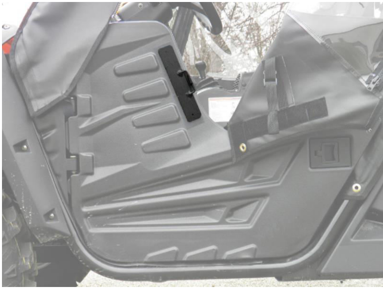
Figure 7: Metal plate has adhesive loop on the back that will attach the adhesive hook placed on the outside of the factory door.