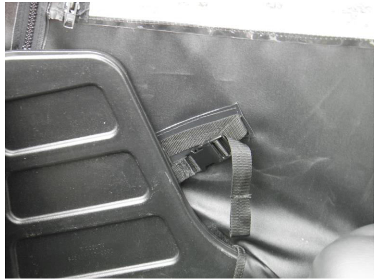
Figure 8: We have included a buckle that will secure the metal plate to the door. If the plate comes loose during use it will stay attached to the door.