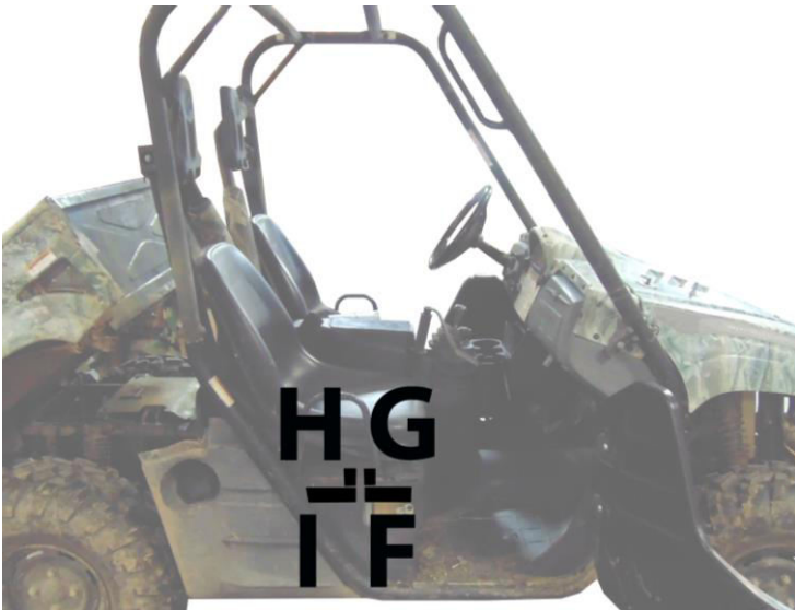
Figure 3: these strips are placed on the inside of the UTV.