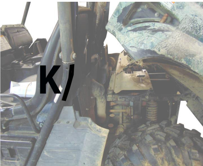
Figure 5: Raise the bed and attach to the bottom of the back roll bar.