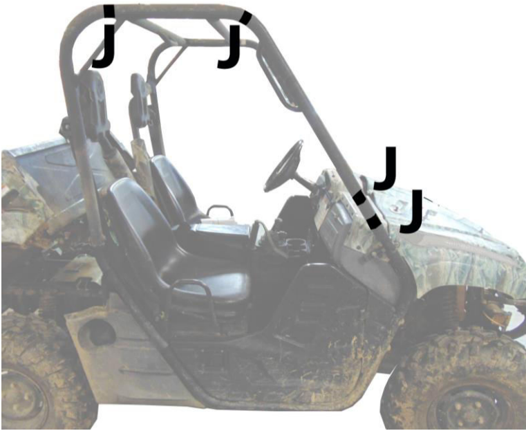
Figure 5: Adhesive strips J will wrap around the bar, The double sided tab on the window of the door kit is for the side grab bar, some UTV may not have this side grab bar.