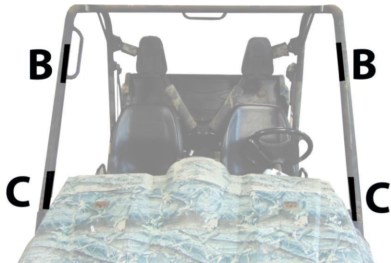
Figure 2: Place these strips more towards the inside of the roll bar. Tabs on the front of the door kit will wrap around the roll bar.