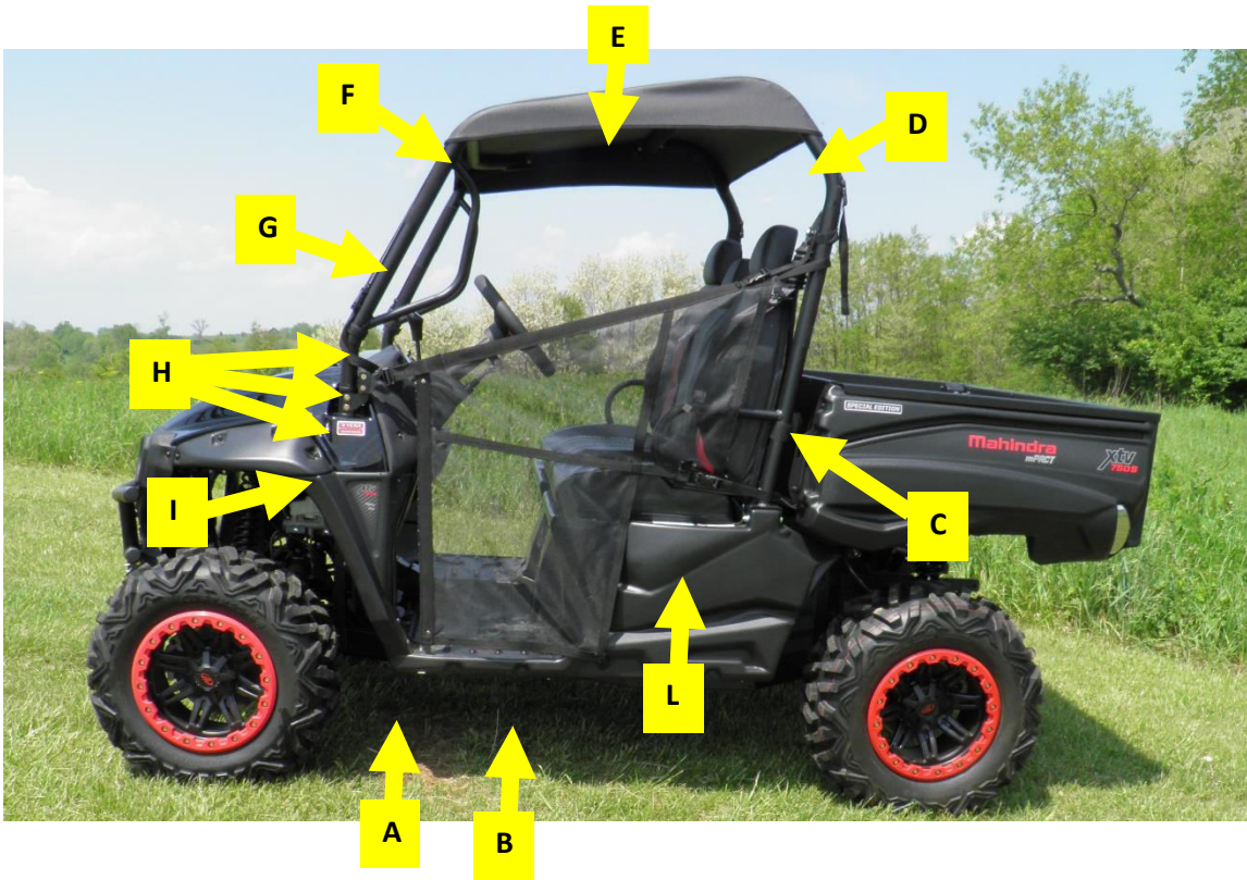
DRIVER DOOR VIEW