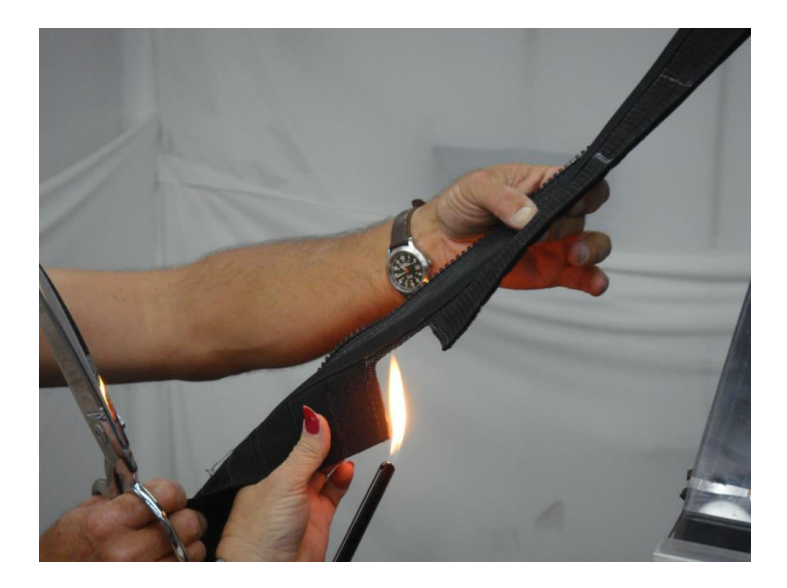
Figure 7.4 – Carefully burn the frayed thread around the cut area with a lighter.