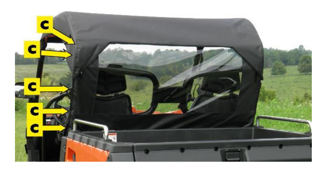
Step 3: After all adhesive hook strips are attached, begin attaching the enclosure to the cab frame. As you attach the hook and loop, square each panel to the frame.

Step 4 : Repeat any steps necessary to achieve a snug fit on the cab frame.