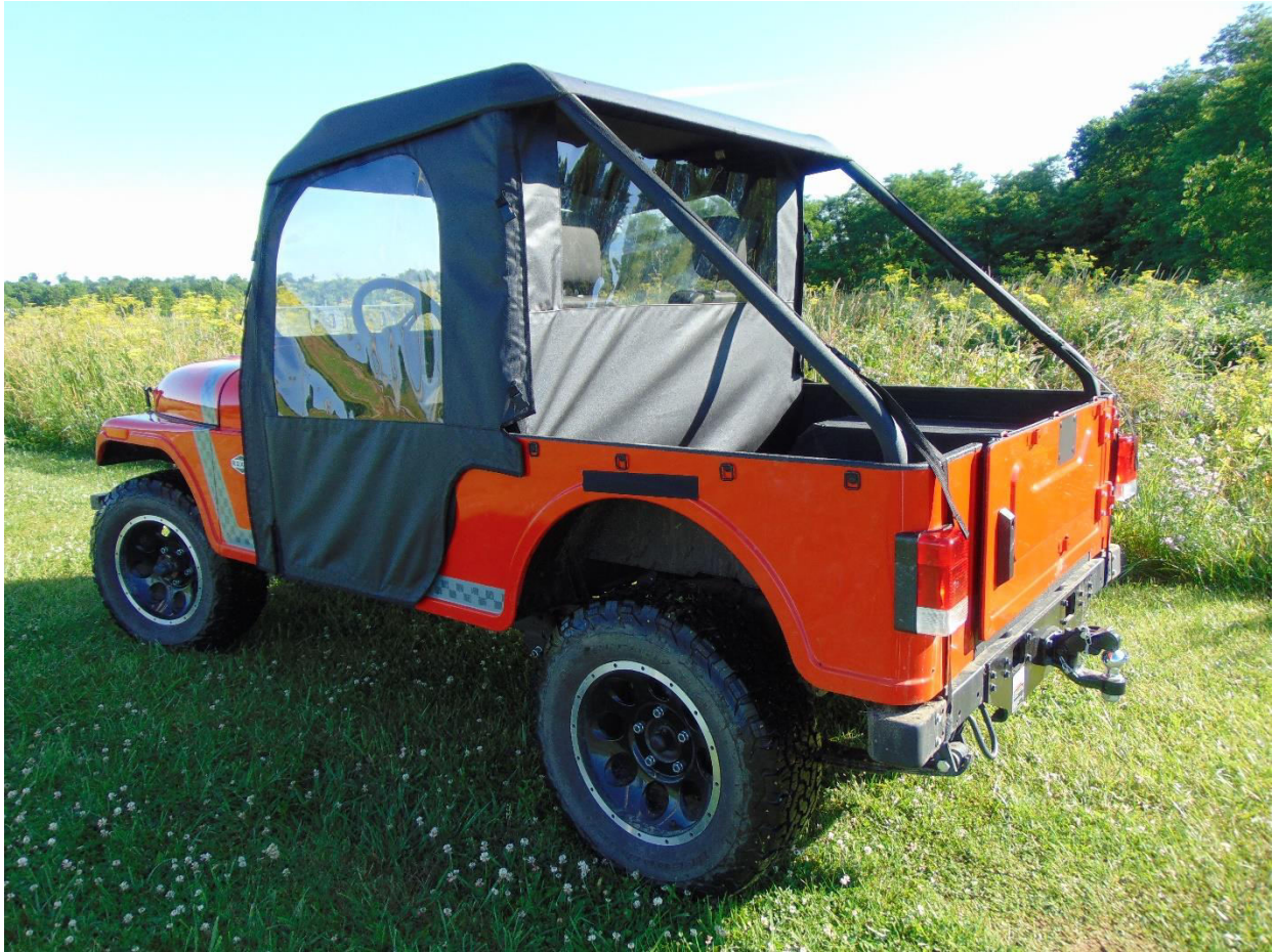
Figure 3: When installation is complete your enclosure should resemble the door in the photo.