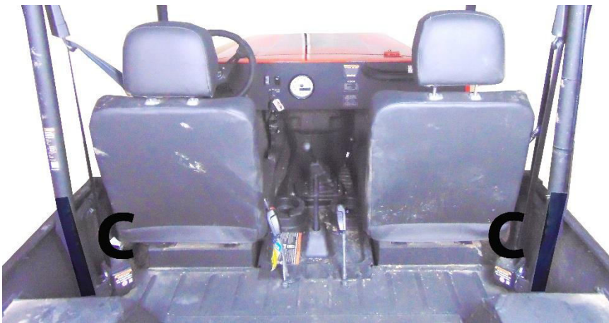
Figure 3: Shows position of 17" Velcro strip C. The bottom back of the back panel will attach to this Velcro strip.