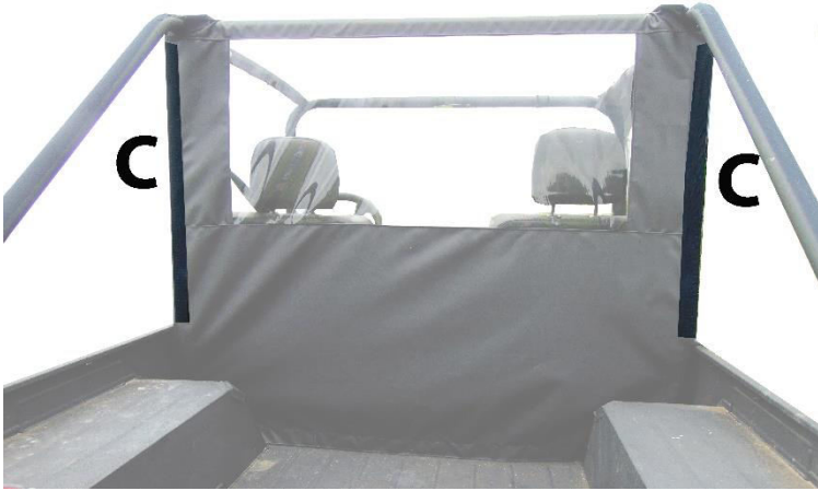
Figure 3: Shows Velcro sewn on the back panel. The tabs on the back of your doors will wrap around and attach to the sewn on Velcro strip.