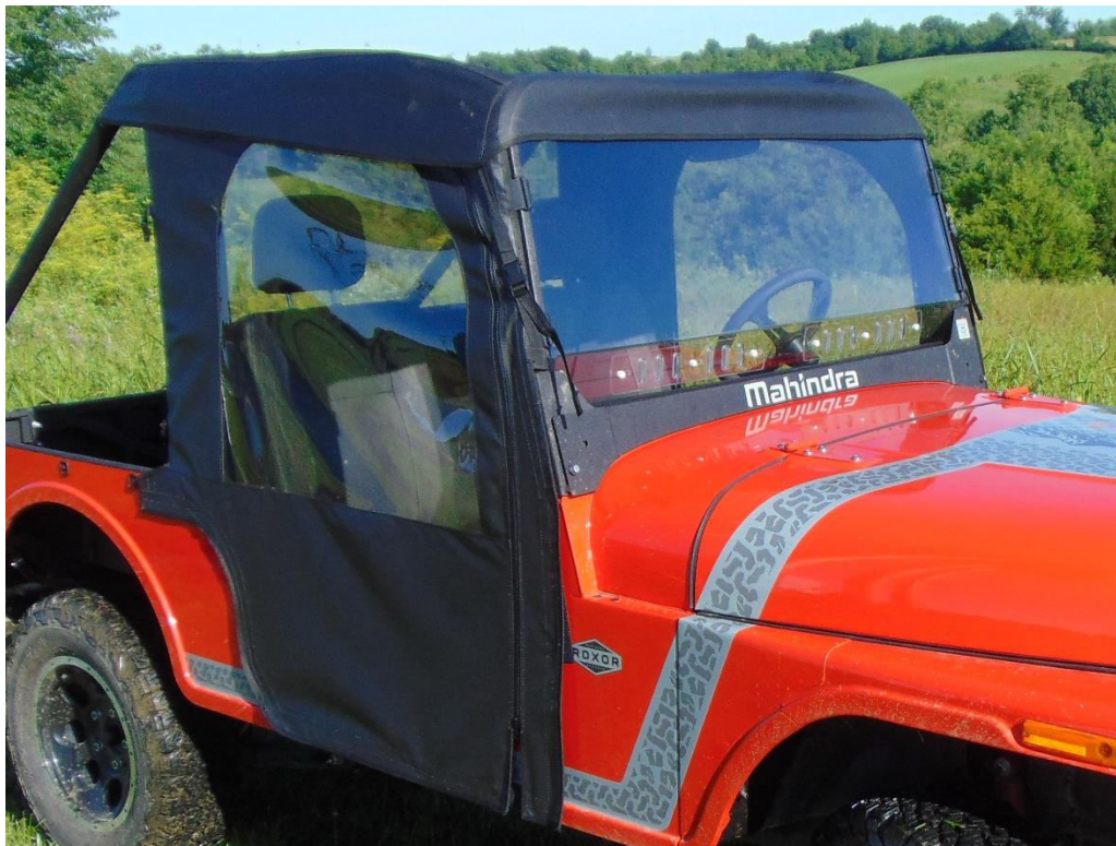
Figure 4: Reinstall your windshield after the door kit and straps for the top cap have been installed. Set the windshield over the straps on the door and the double sided straps for the top cap. Secure windshield into place and then attach the top caps tension straps to the double side straps. Pull top cap into place with the visor of the top cap pulled down over the windshield. This will be a tight fit, walk around the vehicle pulling the straps down evenly.