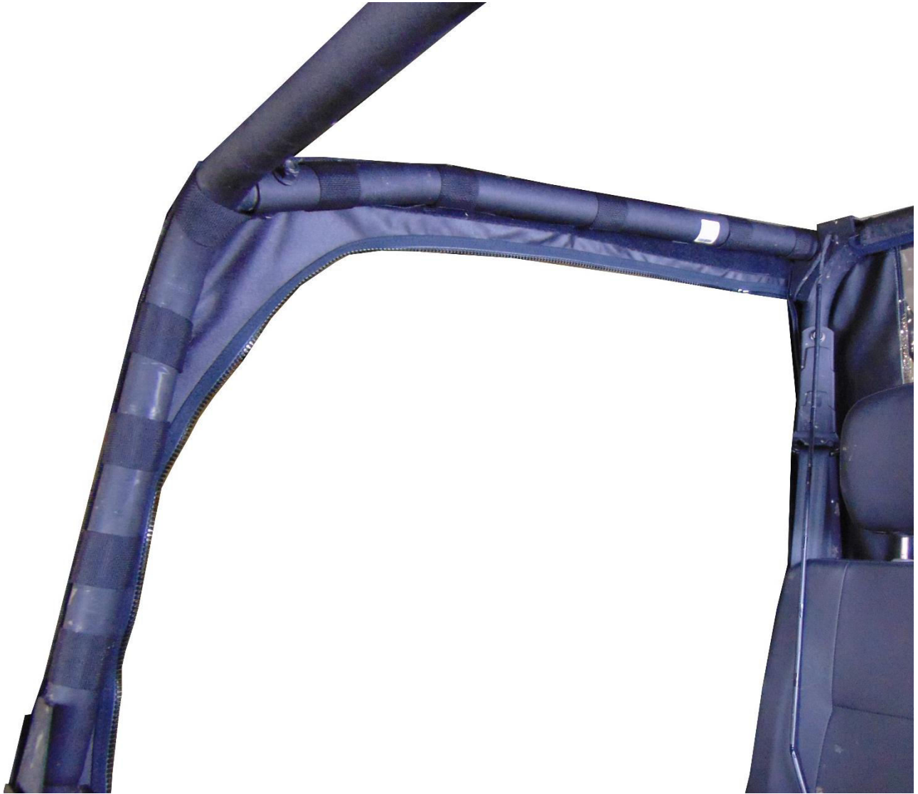
Figure 7: Sewn on Velcro strips on the top and front of the door should be lined up first with the door kits binding resting on the edge of the roll bar. Once the door kit is lined up properly you may then wrap the straps around the bar and attach to adhesive Velcro.