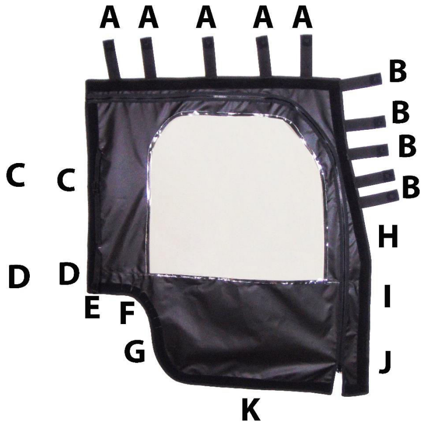
Drivers Side (Inside)