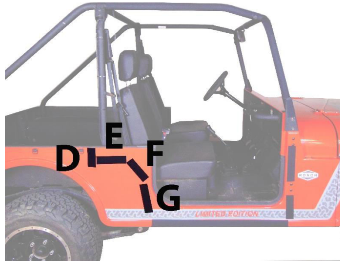
Figure 4: Shows placement of Velcro strips D E F and G.