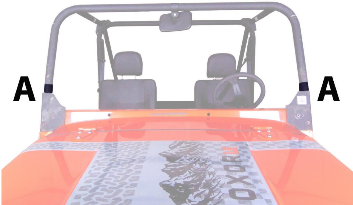
Figure 2: WRAP THESE VELCRO STRIPS AROUND THE ROLL BAR AND ATTACH DOUBLE-SIDED STRAP.