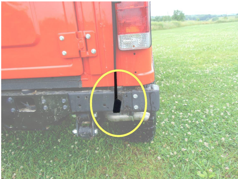
Figure 1: WRAP THE DOUBLE SIDED STRAPS THROUGH THE LARGE ROUND HOLE IN THE BUMPER.