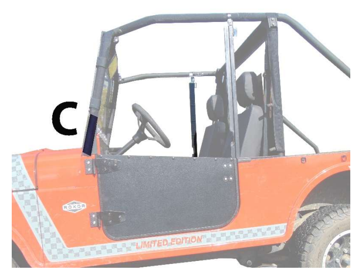
Figure 3: Shows placement of 8" Velcro strips C.