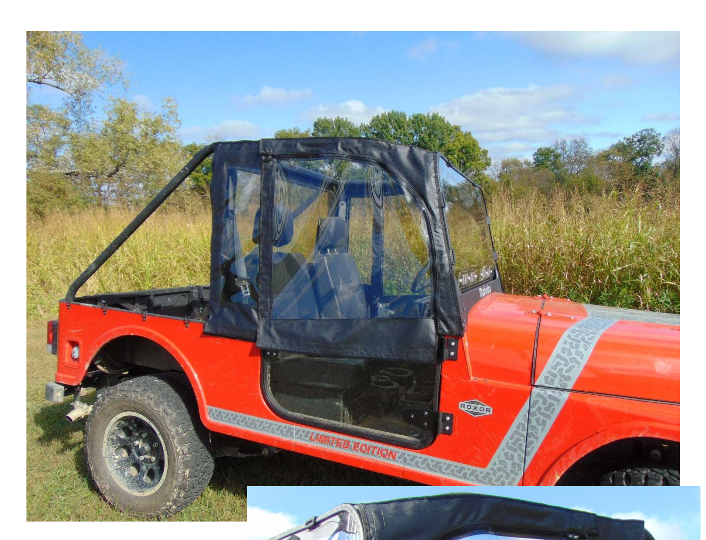
Figure 8: When installation is complete your door should resemble the door in the photo.