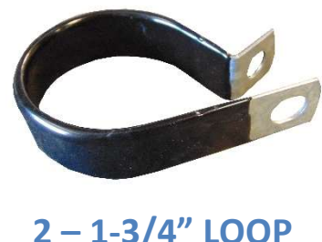
2 – 1-3/4" LOOP CLAMPS