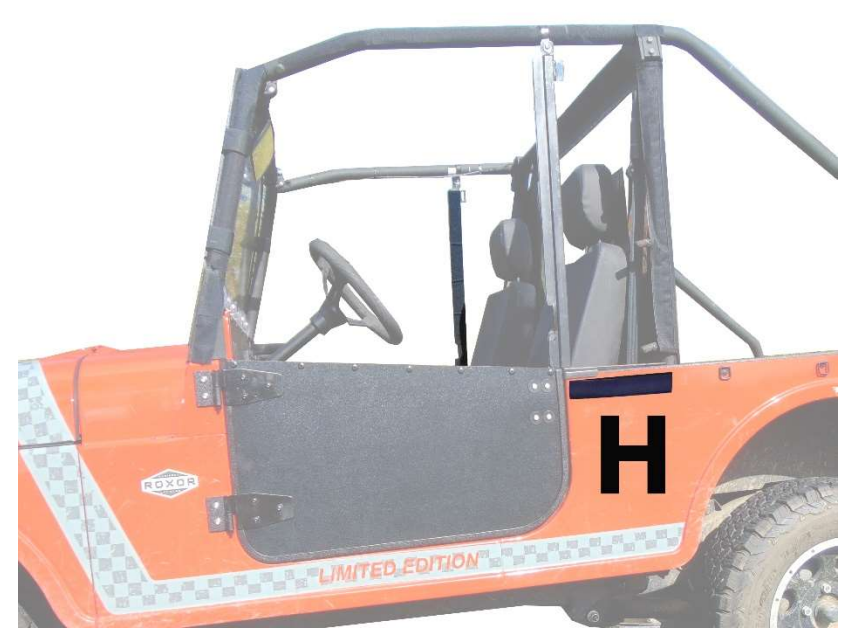
Figure 7: Shows position of 11" Velcro strips H.