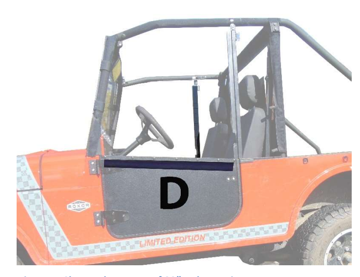
Figure 4: Shows placement of 32" Velcro strips D.