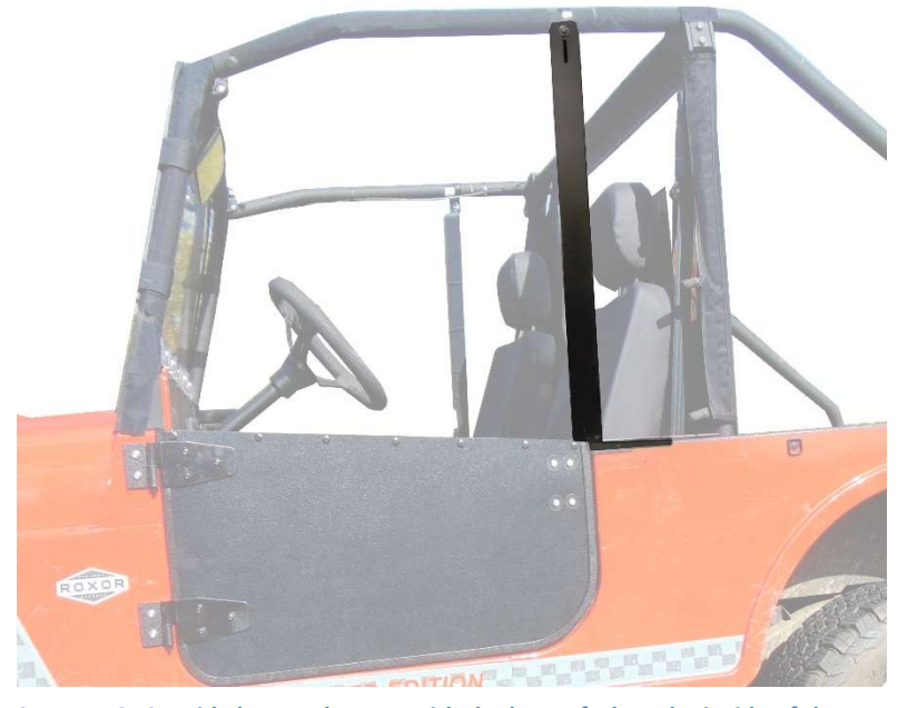
STEP TWO: Set side bar on the UTV with the lower fork to the inside of the cab. Between the UTV body and the seat bar.