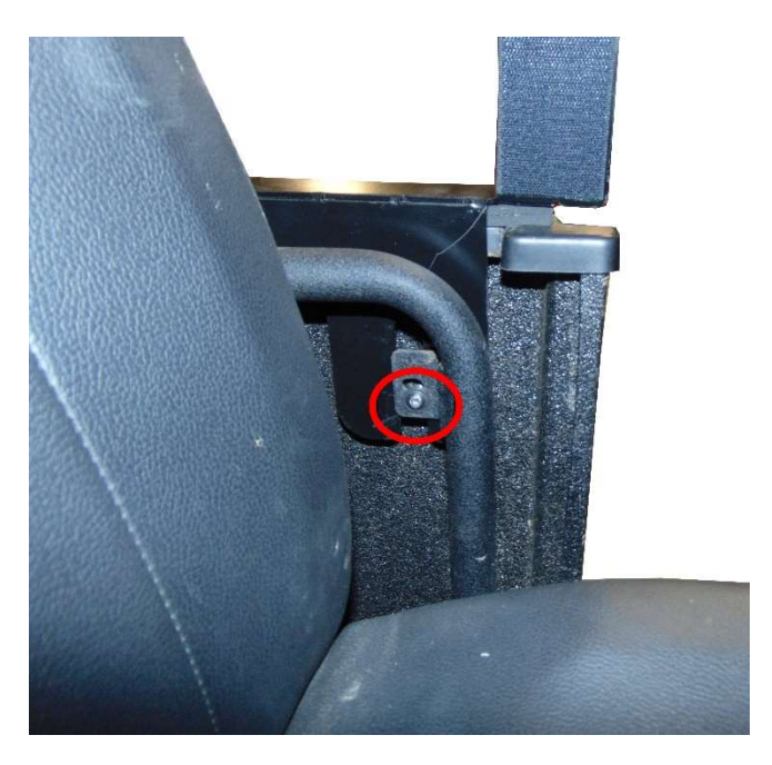
STEP ONE: Remove factory bolt from seat handle bar.