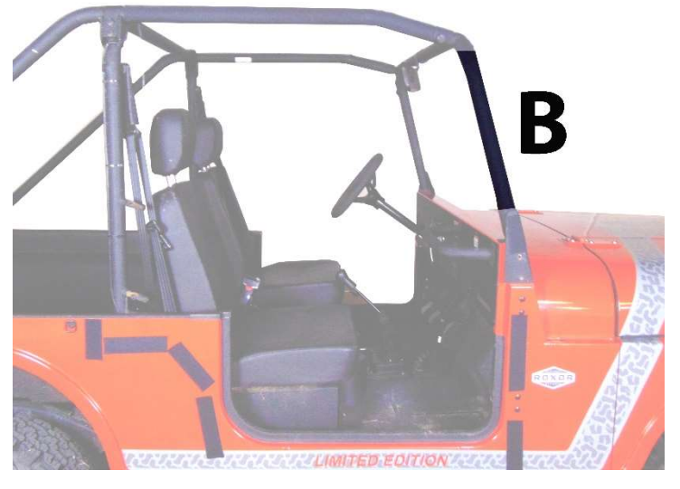
Figure 2: Shows placement of 21" Velcro strips B.