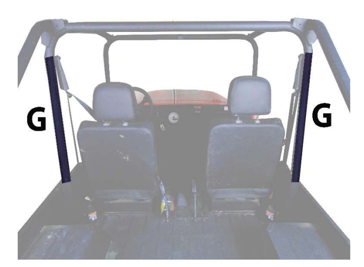
Figure 6: Shows position of Velcro strips G.