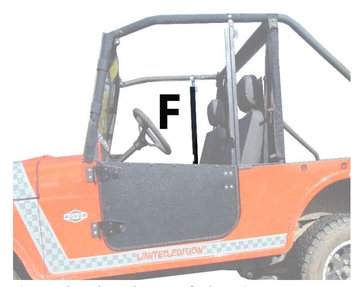
Figure 5: Photo shows placement of Velcro strips F.