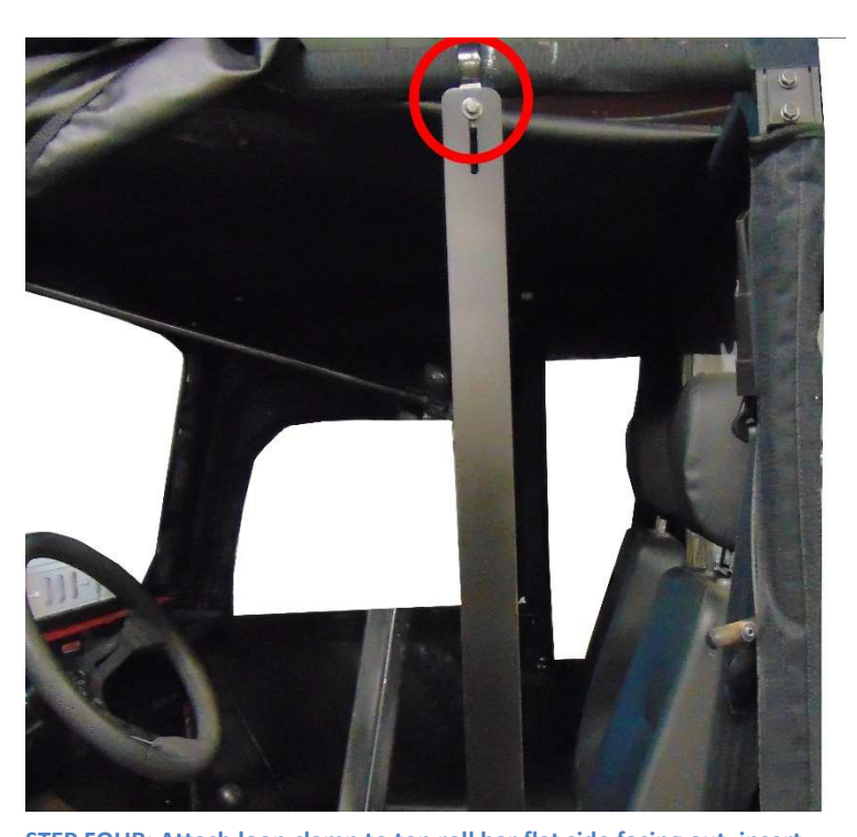
STEP FOUR: Attach loop clamp to top roll bar flat side facing out, insert bolt in washer through the slot in the side bar and through the holes in the loop clamp. Use a washer and nut to hold loop clamp in place. Tighten all hardware.