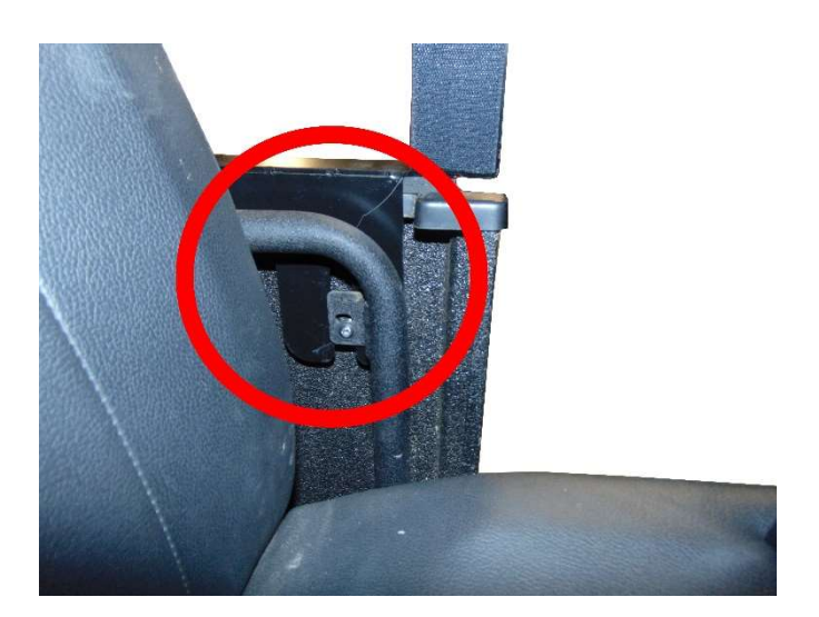
STEP THREE: Line up the fork so that the factory bolt will be replaced in between the tines. Replace factory bolt.