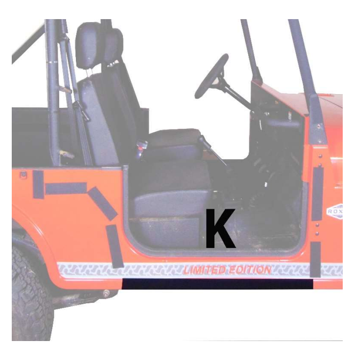
Figure 6: Shows position of Velcro strips K.