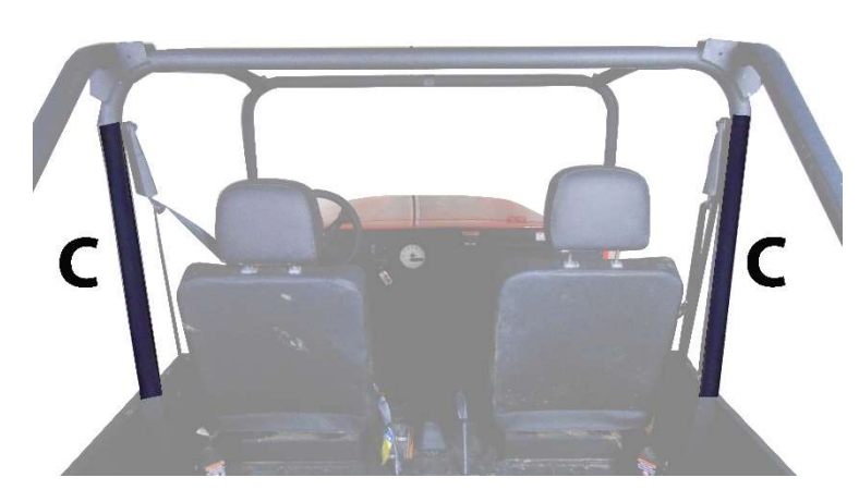
Figure 1: Shows placement of 29" Velcro strips C. The tabs on the back of your doors will wrap around the roll bar and attach to the Velcro strip.