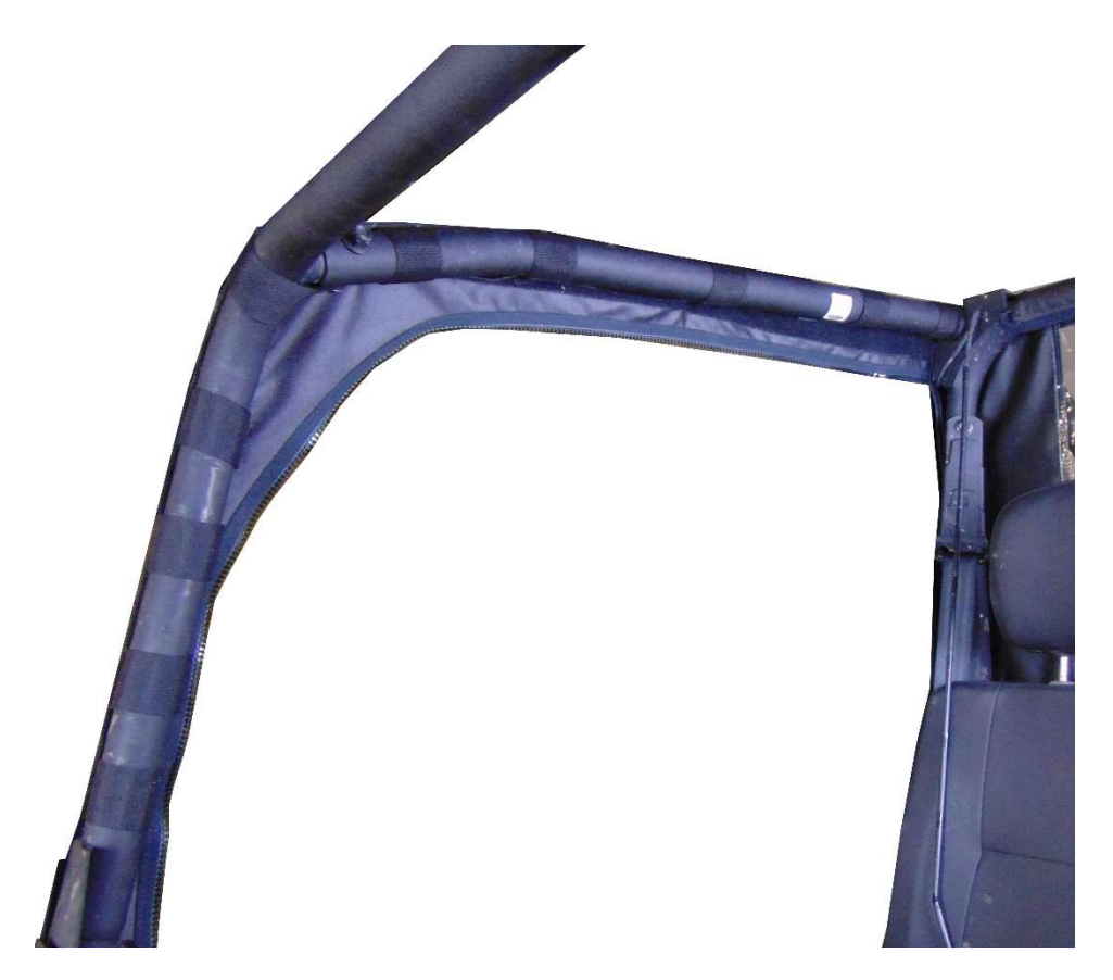
Figure 7: Sewn on Velcro strips on the top and front of the door should be lined up first with the door kits binding resting on the edge of the roll bar. Once the door kit is lined up properly you may then wrap the straps around the bar and attach to adhesive Velcro.