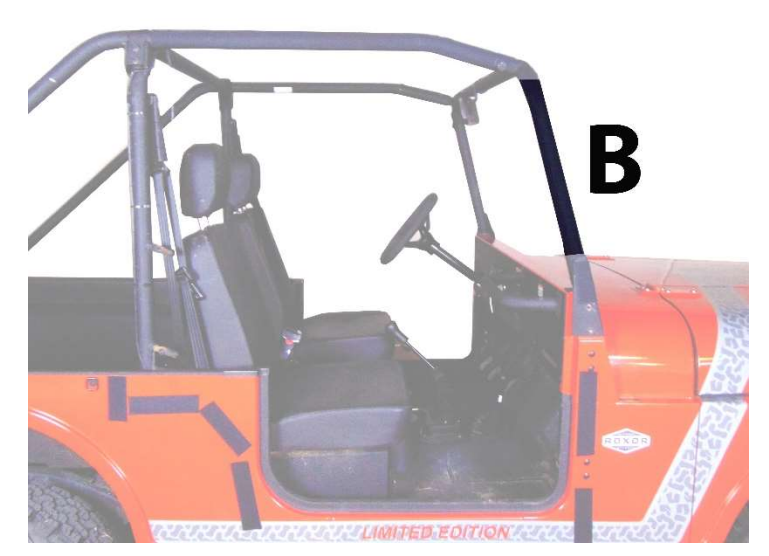
Figure 2: Shows placement of 21" Velcro strips B.