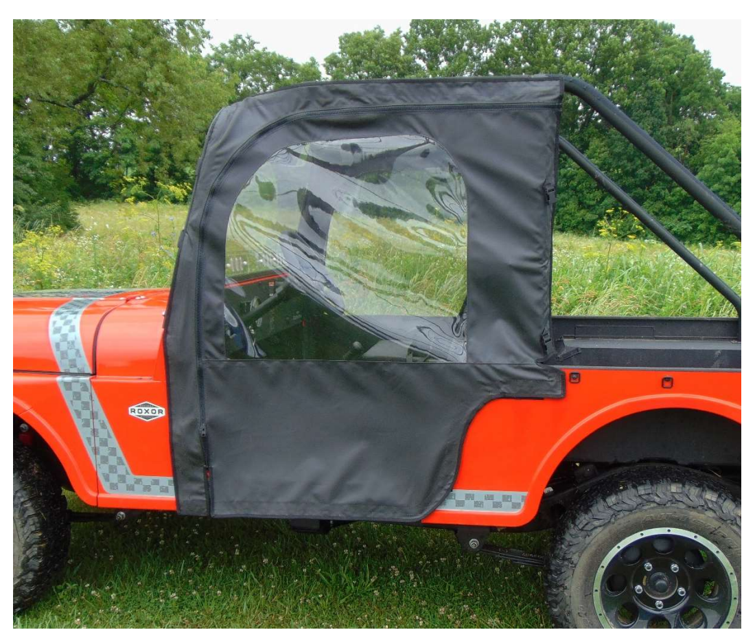
Figure 8: When installation is complete your door should resemble the door in the photo.