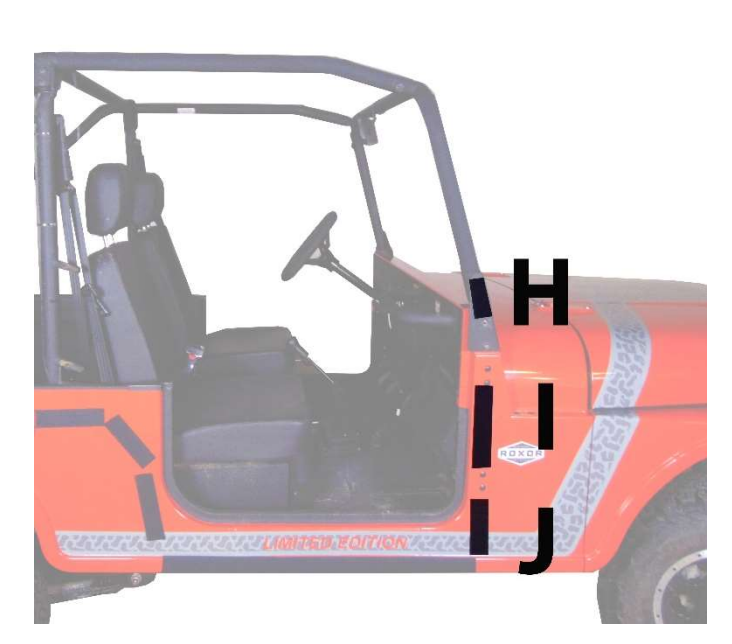
Figure 5: Photo shows placement of Velcro strips H I and J.