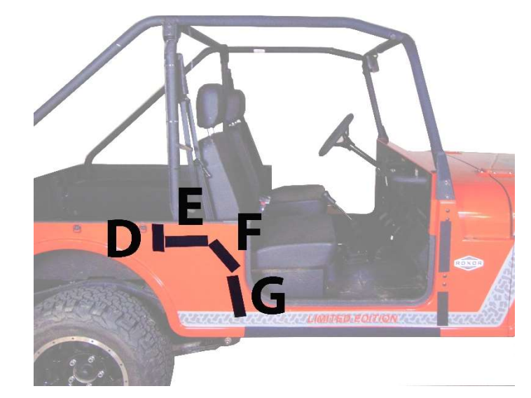
Figure 4: Shows placement of Velcro strips D E F and G