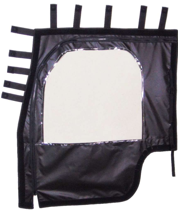
Passenger Side (Inside)