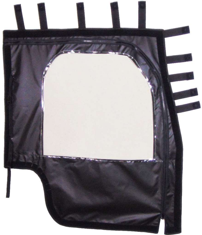
Drivers Side (Inside)