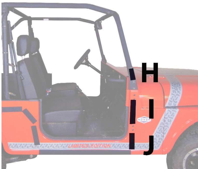
Figure 5: Photo shows placement of Velcro strips H I and J.