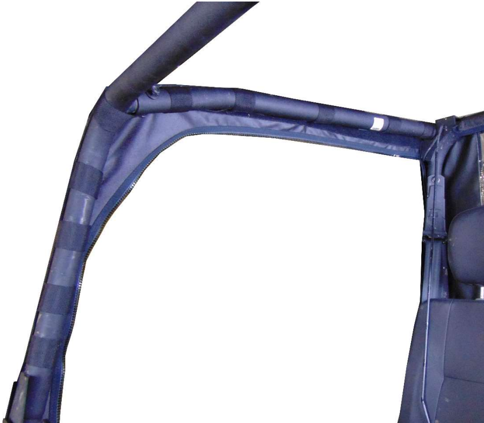
Figure 7: Sewn on Velcro strips on the top and front of the door should be lined up first with the door kits binding resting on the edge of the roll bar. Once the door kit is lined up properly you may then wrap the straps around the bar and attach to adhesive Velcro.