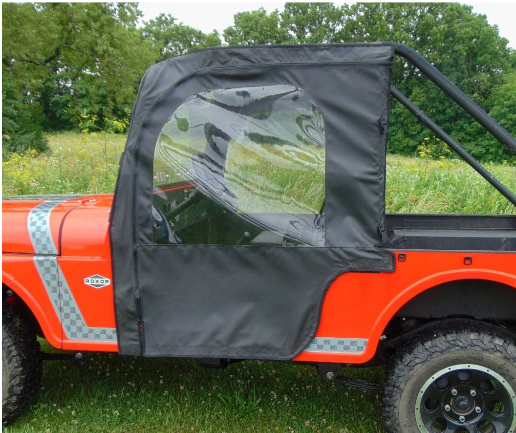
Figure 8: When installation is complete your door should resemble the door in the photo.