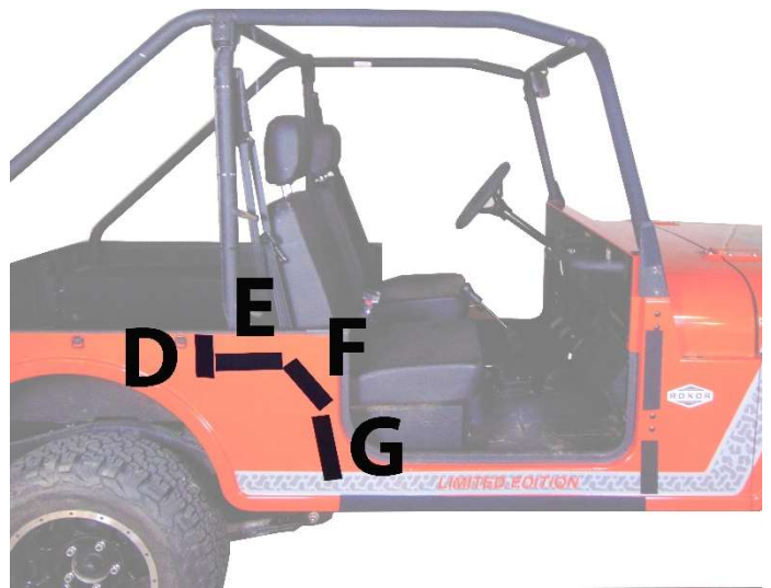
Figure 4: Shows placement of Velcro strips D E F and G