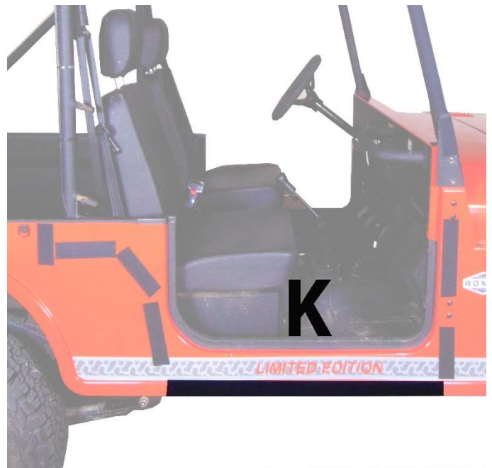
Figure 6: Shows position of Velcro strips K.