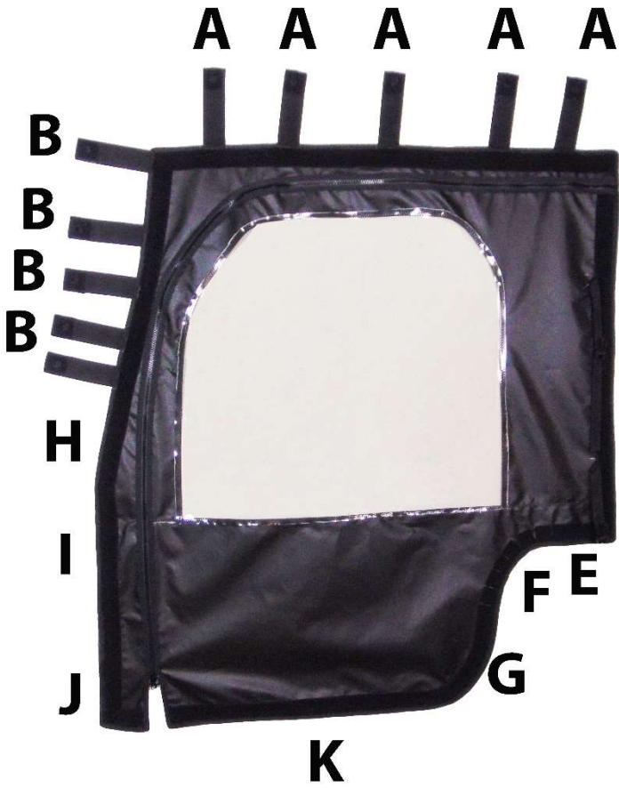
Passenger Side (Inside)