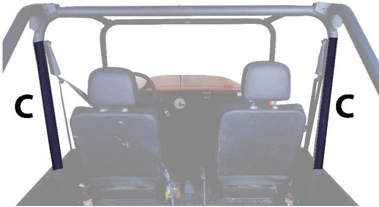
Figure 1: Shows placement of 29" Velcro strips C. The tabs on the back of your doors will wrap around the roll bar and attach to the Velcro strip.