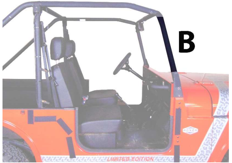
Figure 2: Shows placement of 21" Velcro strips B.