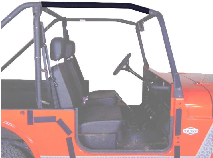
Figure 1: Shows placement of 36" Velcro strips A.