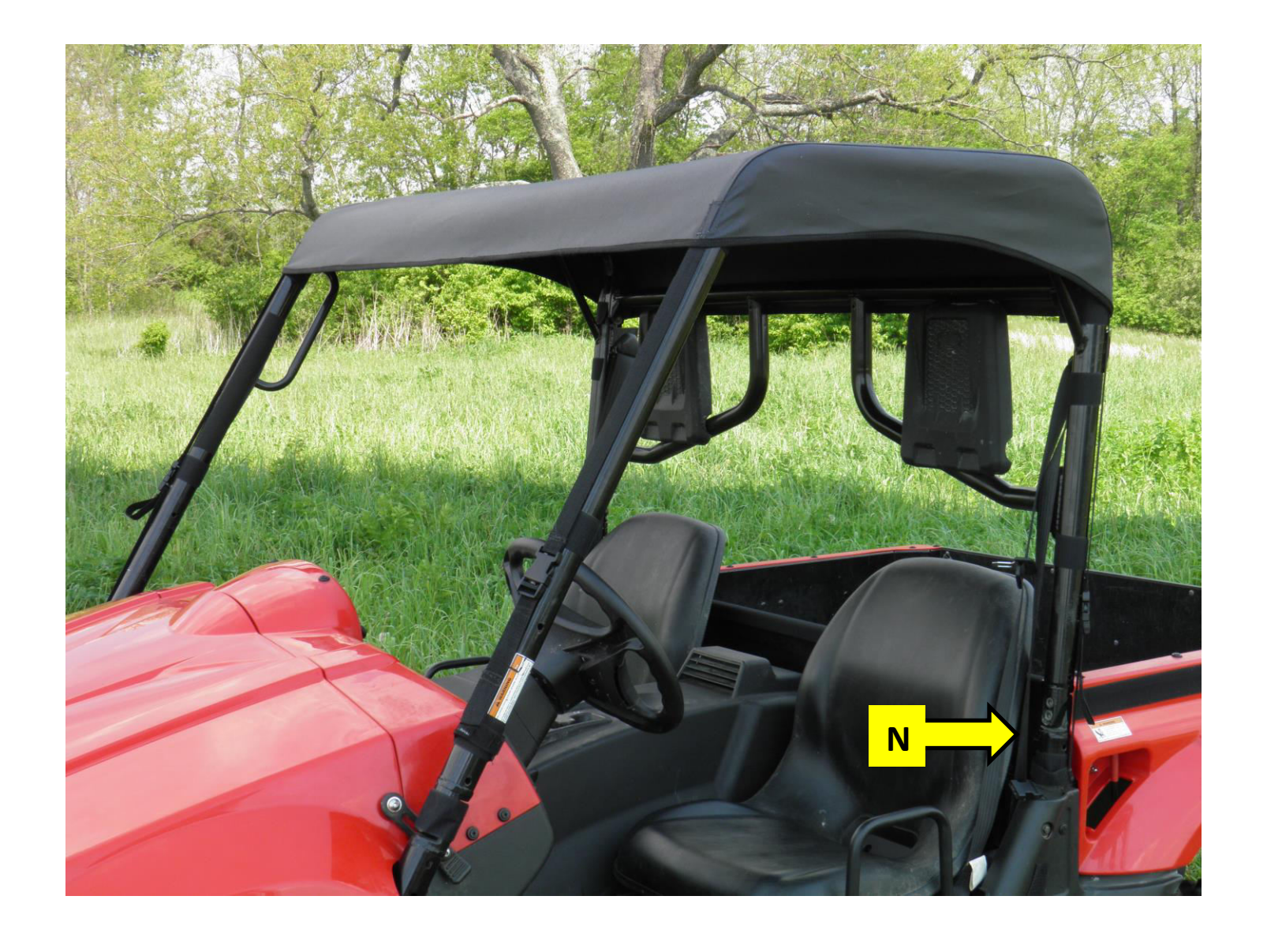
Step 7: Wrap the sewn-in double-sided straps at the bottom of the tension strap around the adhesive hook strips. If needed, loosen the tension strap to extend the length of the strap. DO NOT PULL TIGHT AT THIS TIME.

Step 8: One at time, remove the backing from the 6" Velcro hook strips and fasten each 6" strip horizontally near the bottom of the front roll bar uprights. The following picture shows the approximate location of the adhesive strips.