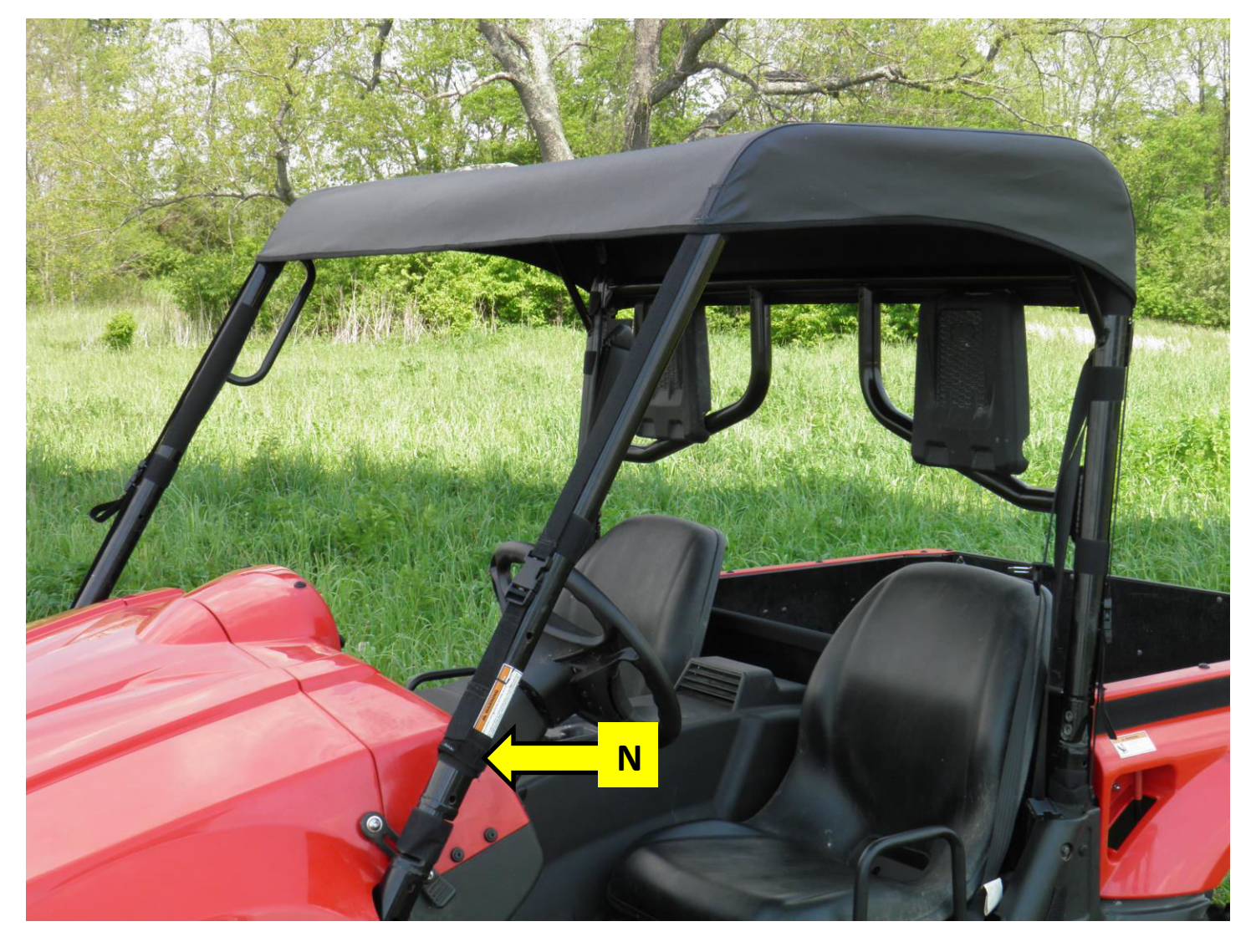
Step 9: Wrap the sewn-in double-sided straps at the bottom of the tension strap around the adhesive hook strips. If needed, loosen the tension strap to extend the length of the strap. DO NOT PULL TIGHT AT THIS TIME.

Step 10: Align the top as needed to straighten to the frame.