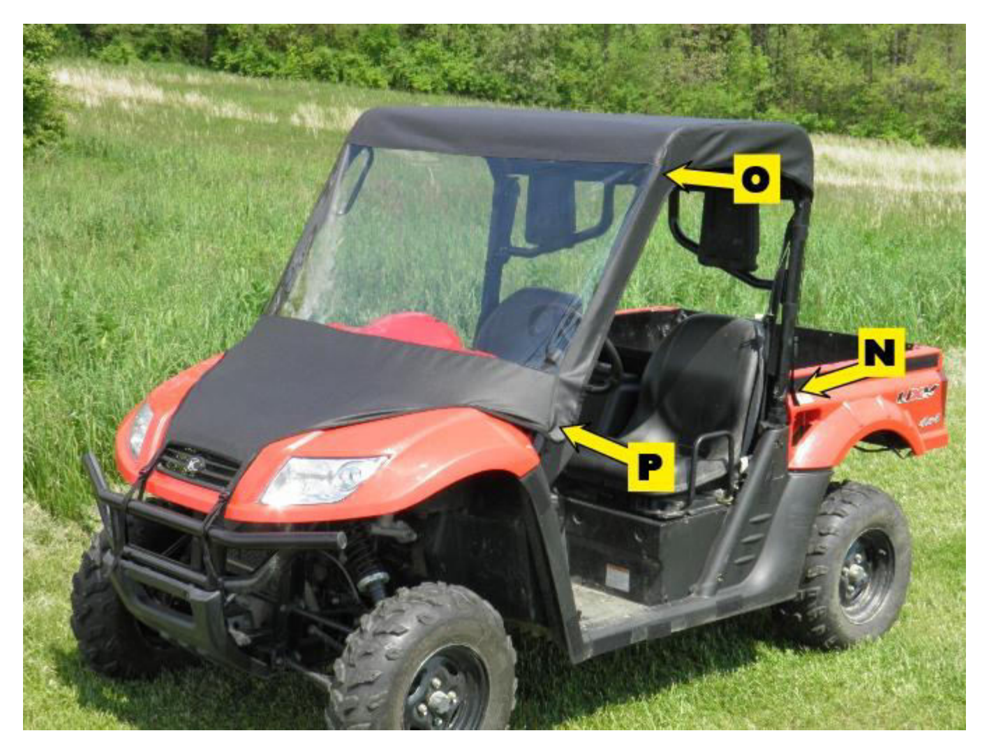
Step 3: After all adhesive hook strips are attached, begin attaching the enclosure to the cab frame. As you attach the hook and loop, square each panel to the frame. PLEASE NOTE, FOR MAXIMUM ADHESION, ALLOW THE ADHESIVE HOOK TO ADHERE TO THE FRAME FOR 24 HOURS BEFORE PULLING AGAINST THE HOOK WITH THE LOOP STRIPS.

Step 4 : Repeat any steps necessary to achieve a snug fit on the cab frame.