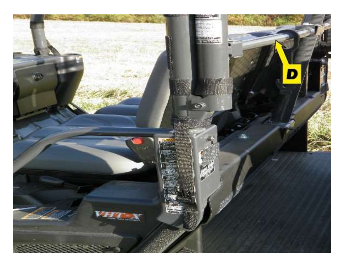
Step 6: The top panel attach to the cab frame by tension straps sewn into the front and rear corners and at the middle roll bars. If necessary, disconnect the bottom of the tension straps from the top. Re-align the top to the cab frame. Attach the adhesive hook strips as indicated below. As the table indicates, with the door panels and rear panel installed, some of the adhesive strips are not needed. After the top is aligned and the adhesive strips are attached, connect the snap buckles on each of the tension straps. Again, with the top in proper alignment, begin pulling the tension straps down to tighten the top to the cab frame. Do not fully pull one side tight without adjusting the other side. Add a slight amount of tension to each strap as you work your way around the top.