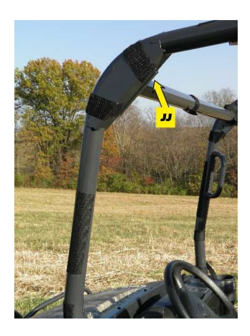
Step 7 : Repeat any steps necessary to achieve a snug fit on the cab frame.

See enclosed Product Care sheet for instructions on how to properly care for your 3SI UTV Enclosure.