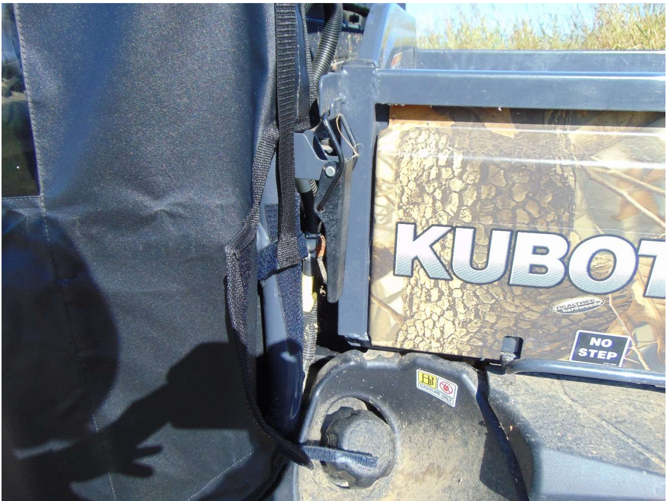
Attach double sided strap to the prepositioned Velcro, wrap straps around the roll bar below the seat rest bar.