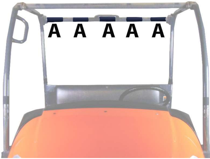
Figure 1: Shows position of 24" Velcro strip A. Wrap tab over the top of the roll bar and attach to the adhesive Velcro strip.