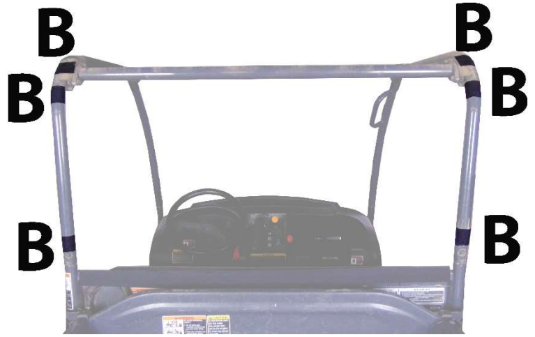
Figure 2: Shows position of 16" Velcro strips B