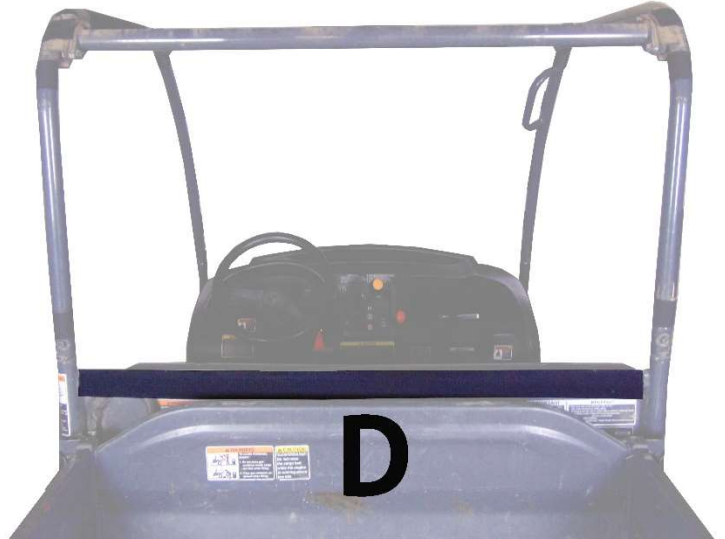
Figure 4: Shows placement of 6" strips D.