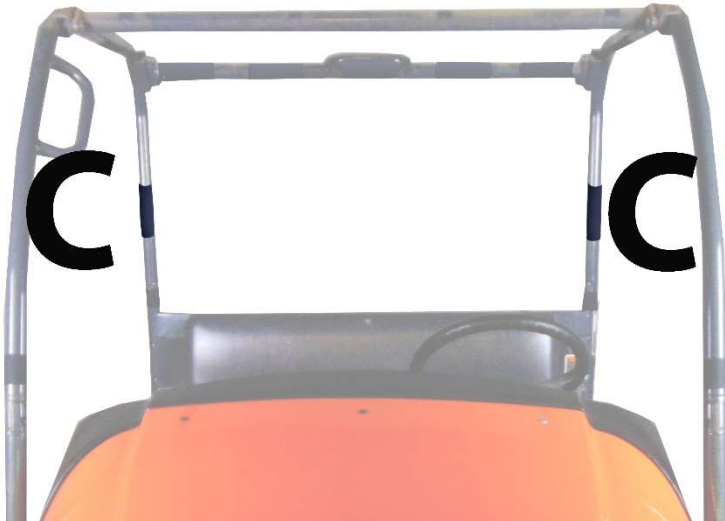
Figure 3: Shows position of 6" Velcro strips C. The double sided straps will wrap around these Velcro strips.