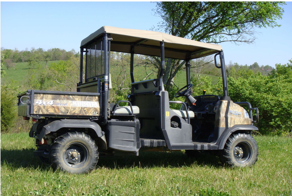
Figure 5.1 - re-tighten each Velcro Tab until the Top Cap is tight on all sides and no major wrinkles are showing.

Step 5: If necessary, repeat step 4 pulling downward firmly and re-attaching each of the Velcro Tabs until the Top Cap is tight and there are no wrinkles in the Top Cap Enclosure as shown in figure 5.1