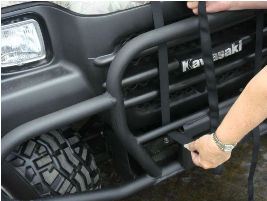
Figure 4.1 - run front hood straps through the center bar of the front bumper

Step 4: Fasten pre-attached Enclosure Front Hood Straps to the center bar of the Vehicle front bumper as shown in the picture 4.1. Bringing the end of the straps up to the latch buckle, run the end through the back of the top buckle opening first and then through the front of the lower buckle opening as shown in picture 4.2. DO NOT FULLY TIGHTEN FRONT HOOD STRAPS AT THIS TIME.