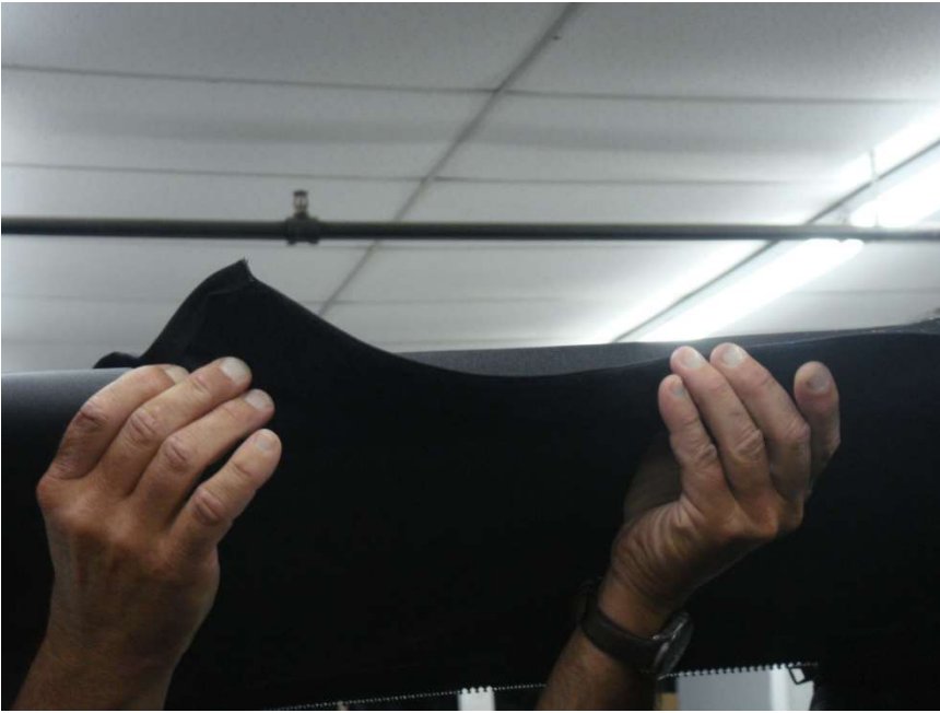
Figure 4.2 – attach Top Cap top side roll bar tabs to installed 13” Velcro strips

Step 5: Repeat step 4 pulling downward firmly and re-attaching each of the Velcro Tabs until the Top Cap is tight and there are no wrinkles in the Top Cap Enclosure as shown in figure 5.1