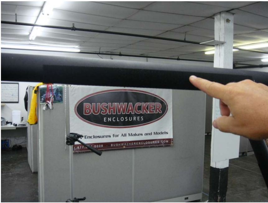
Figure 3.1 – adhere 13” Velcro strips above the door area on the Roll Bar Cross-member

Step 4: Pull the Enclosure down tightly keeping Enclosure seams aligned with the center of each Roll Bar and attach each Enclosure Velcro Tab to its respective installed 6” Velcro Strip as shown in figure 4.1. Attach Top Side Roll Bar Cross-member tabs to installed 13” Velcro strips as shown in figure 4.2