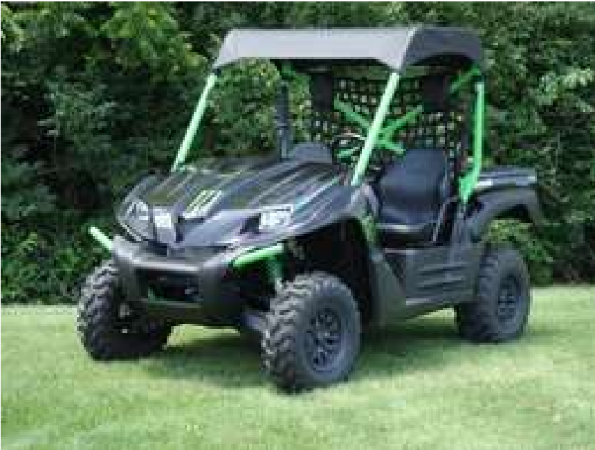
Figure 5.1 - re-tighten each Velcro Tab until the Top Cap is tight on all sides and no major wrinkles are showing.

Step 5: Repeat step 4 pulling downward firmly and re-attaching each of the Velcro Tabs until the Top Cap is tight and there are no wrinkles in the Top Cap Enclosure as shown in figure 5.1