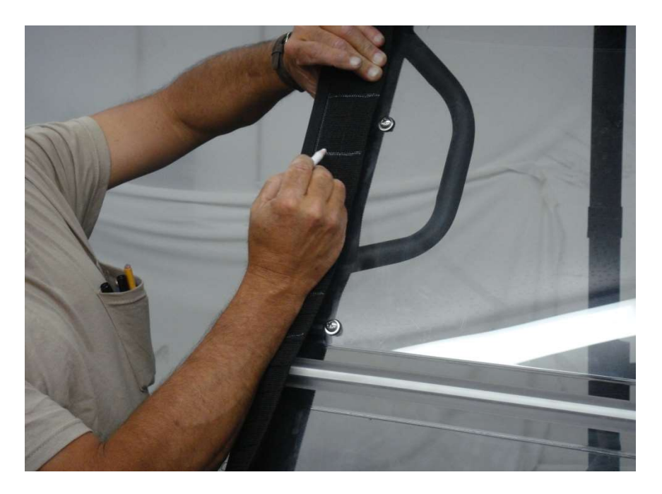
Figure 872 - Mark the Windshield Velcro Tabs for hard windshield Clamp locations