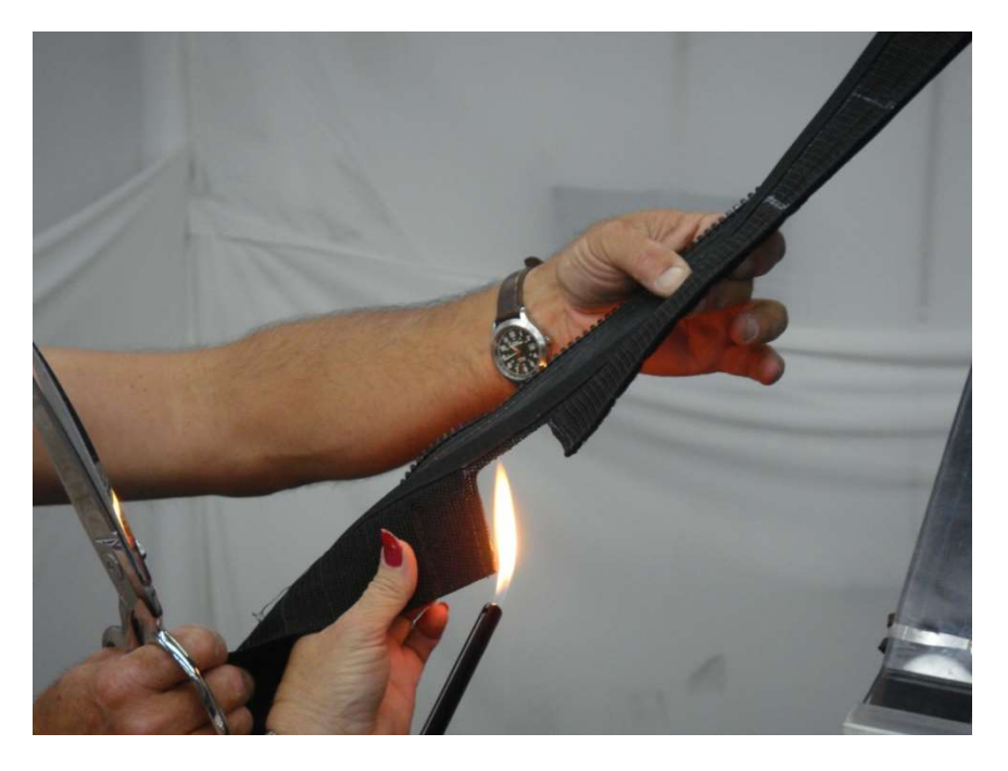
Figure 7.4 – Carefully burn the frayed thread around the cut area with a lighter.

Step 8: Zip Doors closed making sure the bottom door magnets attach to vehicle lower side Door Rocker Panel