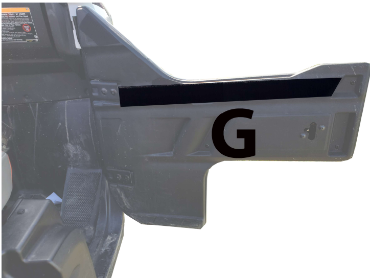
Figure 5: Shows placement of Velcro strips G.