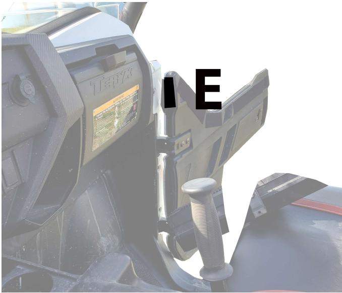
Figure 3: Photo shows placement of Velcro strip E.