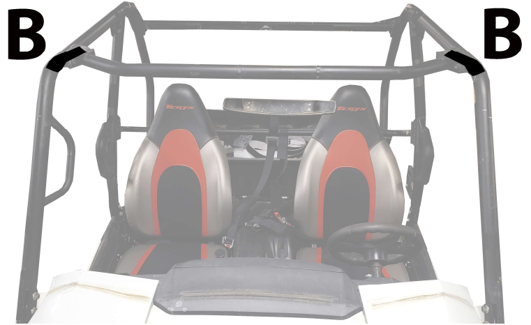
Figure 2: Shows placement of Velcro strips B.