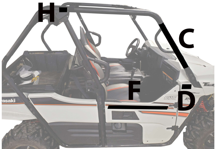
Figure 4: Shows placement of Velcro strip C D F and H.