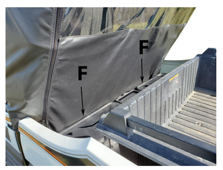
Figure 4: Pull your back panel down tight and stick the bottom to these strips.