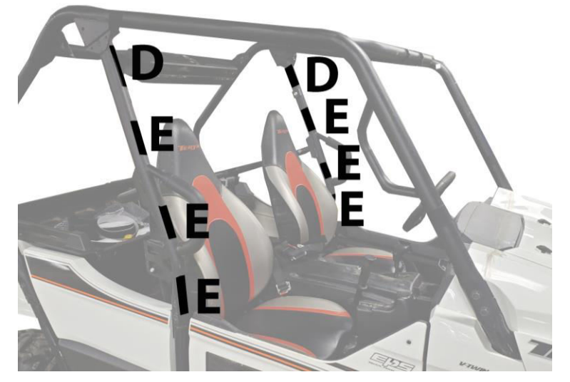
Figure 3: Pull these tabs around the side and pull tight.

Figure 1: Pull your back panel from the inside and wrap the top of the back panel over the rear roll bar and around to the outside. More photos below.