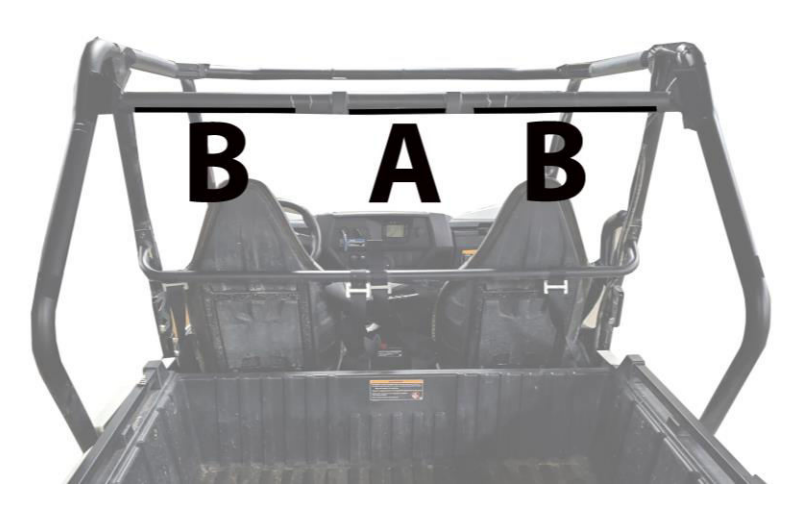
Figure 1: Pull your back panel from the inside and wrap the top of the back panel over the rear roll bar and around to the outside. More photos below.