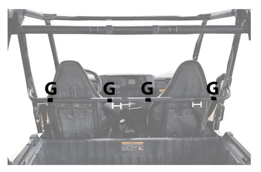
Figure 5: Wrap around roll bar, for extra hold.