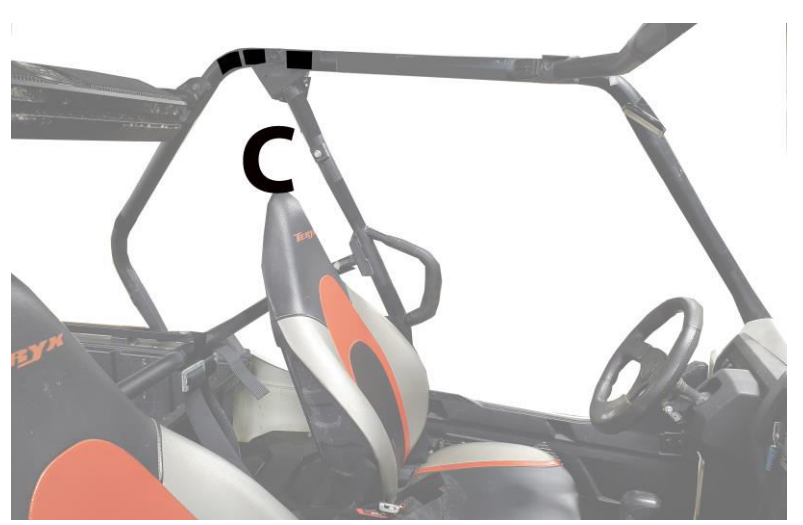
Figure 1: Wrap these tabs around and over the top side roll.