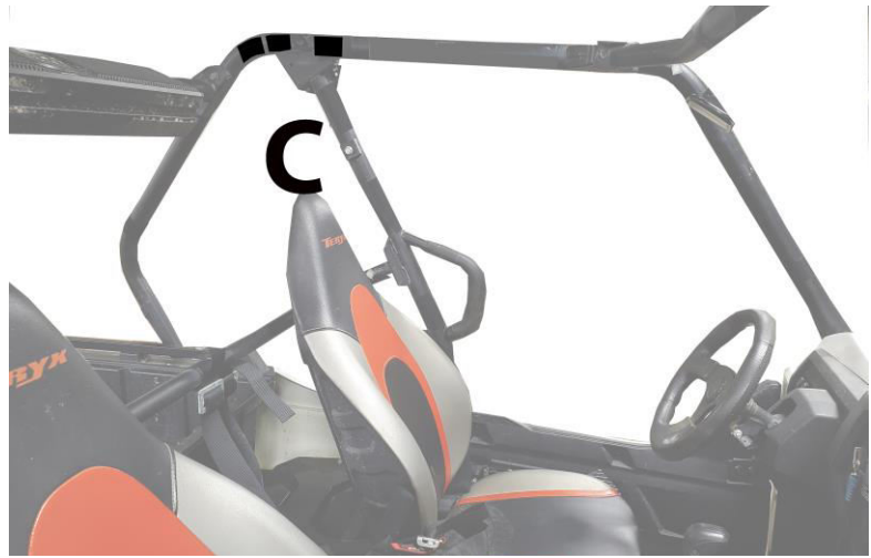
Figure 1: Wrap these tabs around and over the top side roll.