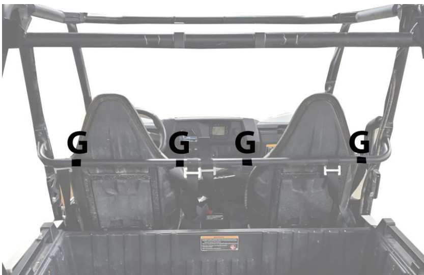
Figure 5: Wrap around roll bar, for extra hold.