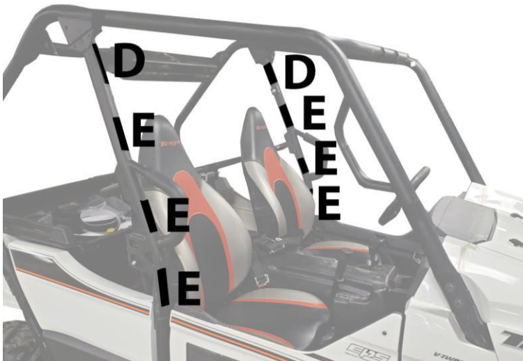
Figure 3: Pull these tabs around the side and pull tight.