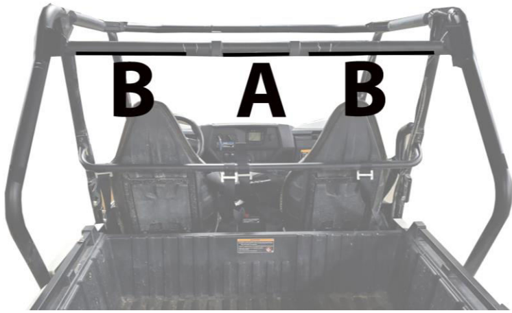
Figure 1: Pull your back panel from the inside and wrap the top of the back panel over the rear roll bar and around to the outside. More photos below.