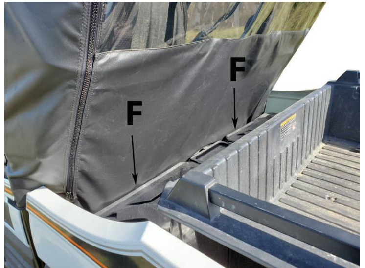
Figure 4: Pull your back panel down tight and stick the bottom to these strips.