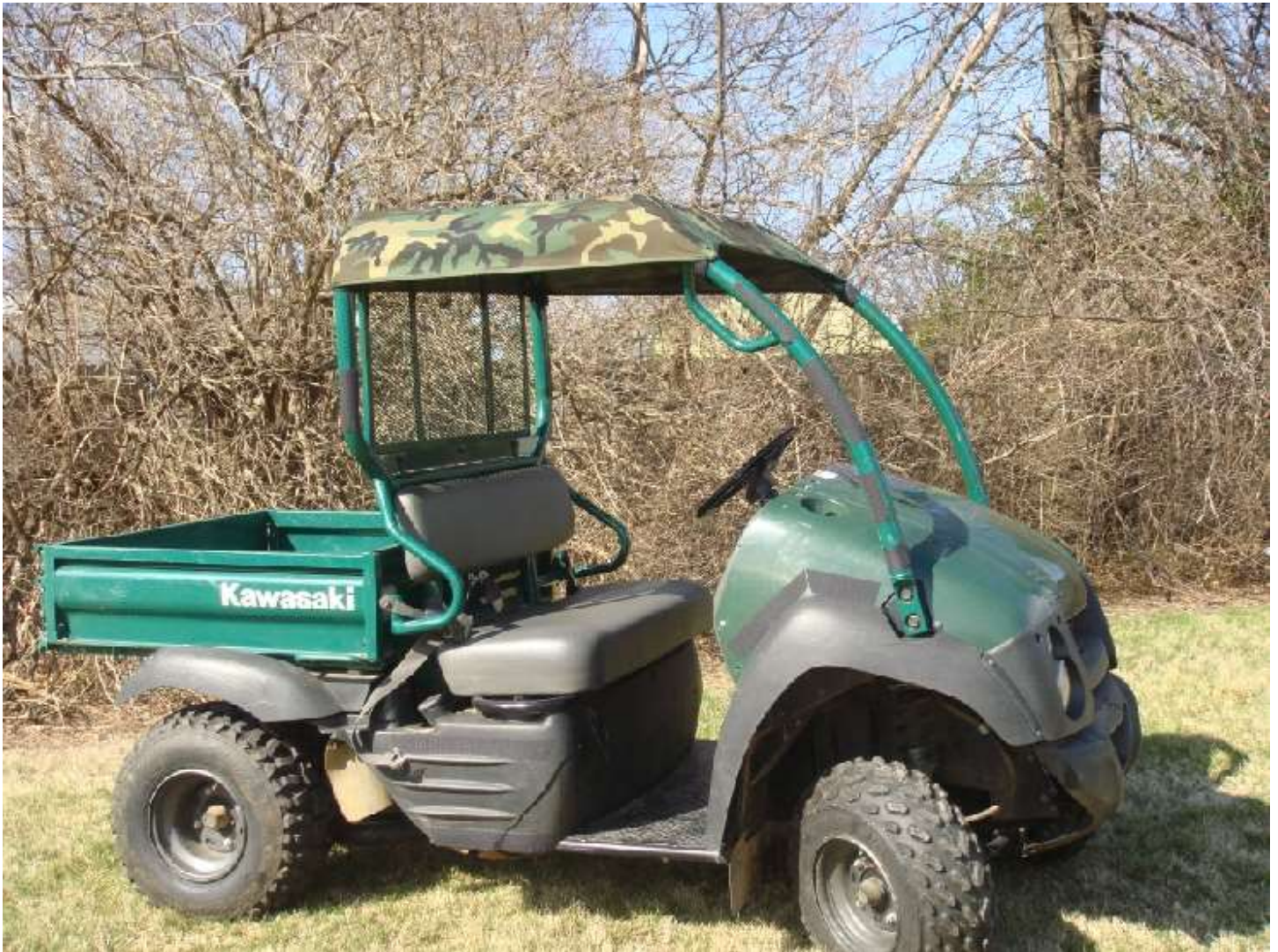
Figure 5.1 - re-tighten each Velcro Tab until the Top Cap is tight on all sides and no major wrinkles are showing.

Step 5: Repeat step 4 pulling downward firmly and re-attaching each of the Velcro Tabs until the Top Cap is tight and there are no wrinkles in the Top Cap Enclosure as shown in figure 5.1