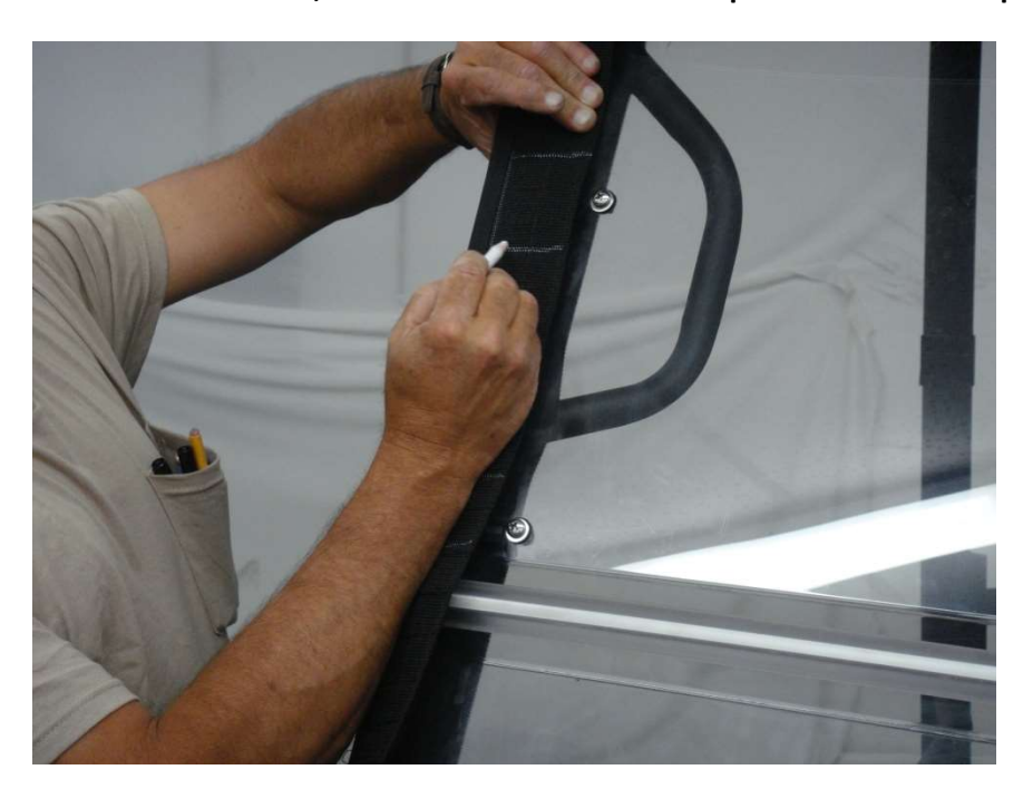
Step 3: Cut a section out around where your clamps will be positioned on the Velcro tab as shown. Be careful not to cut the binding.

Step 2: With the enclosure on the cab frame, mark the location of the clamps on the Velcro strips as shown.