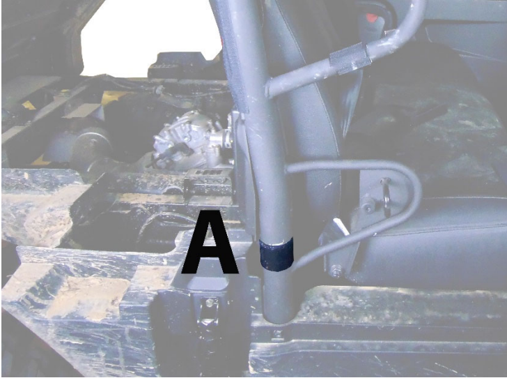
Figure 1: RAISE THE BED, WRAP THESE VELCRO STRIPS AROUND THE ROLL BAR ON EITHER SIDE OF THE MACHINE AND ATTACH DOUBLE-SIDED STRAP.