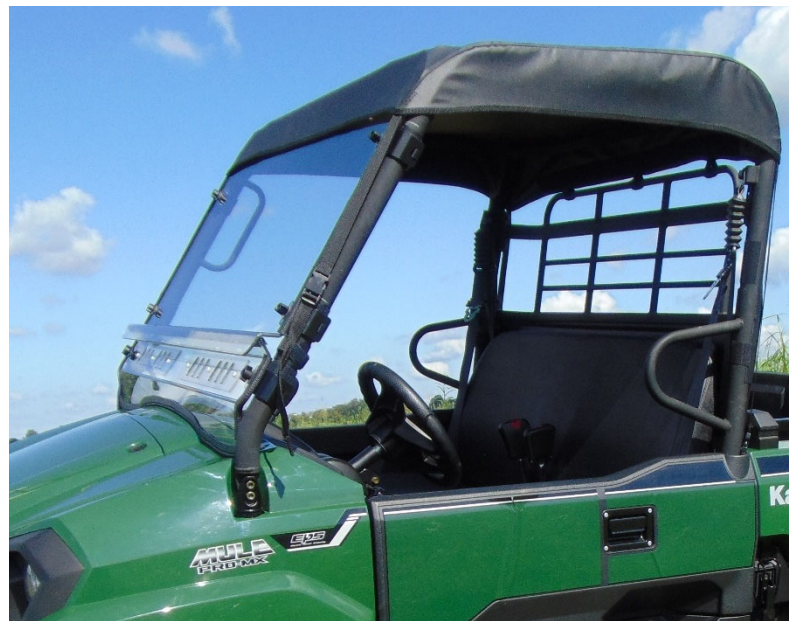
Figure 1: WE HAVE SEWN DOUBLE SIDED STRAPS ON TO THE BACK OF THE TOP CAP TO LOOP AROUND THE TOP OF THE METAL GRATE ON THE BACK OF THE MACHINE. LOOPING THESE STRAPS WILL PREVENT THE TOPCAP FROM MOVING IN THE WIND.