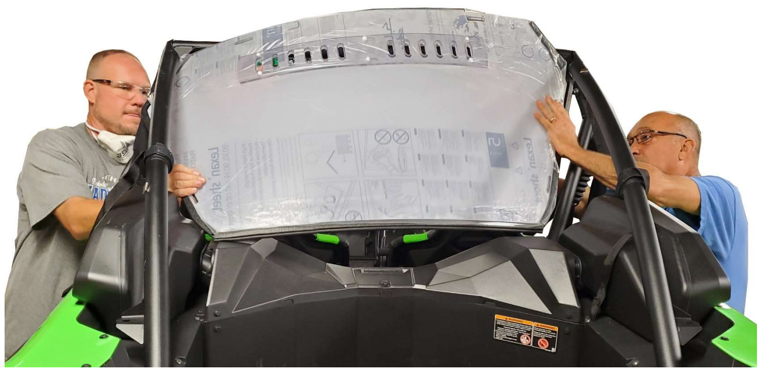
YES THEY ARE BENDING THE LEXAN. EACH OF YOU NEED TO PLACE ONE HAND IN THE CENTER OF THE LEXAN AND PUSH TO BEND IT. YOU WILL NOT BREAK IT DON'T BE AFRIAD TO PUT A LOT OF PRESURE ON THE BACK PANEL.