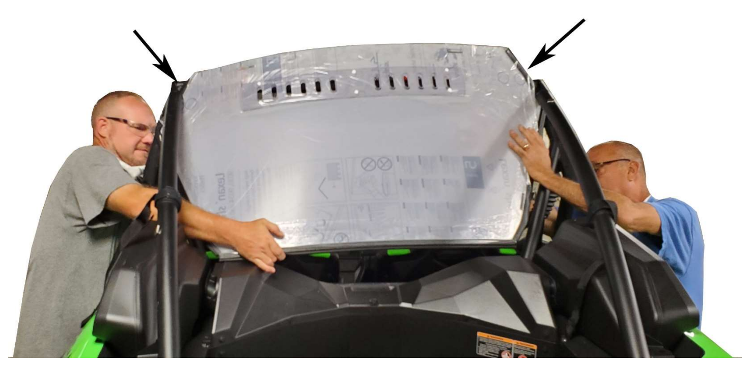
ONCE YOU HAVE THE TOP OF THE BACK PANEL IN BETWEEN THE ROLL BARS, THEN YOU WILL PUSH ON THE CENTER FROM THE INSIDE UNTIL THE BOTTOM CAN BE PULLED OVER THE FACTORY BED. YOU MAY NEED TO RAISE THE BACK PANEL UP SOME LIKE THEY ARE DOING.