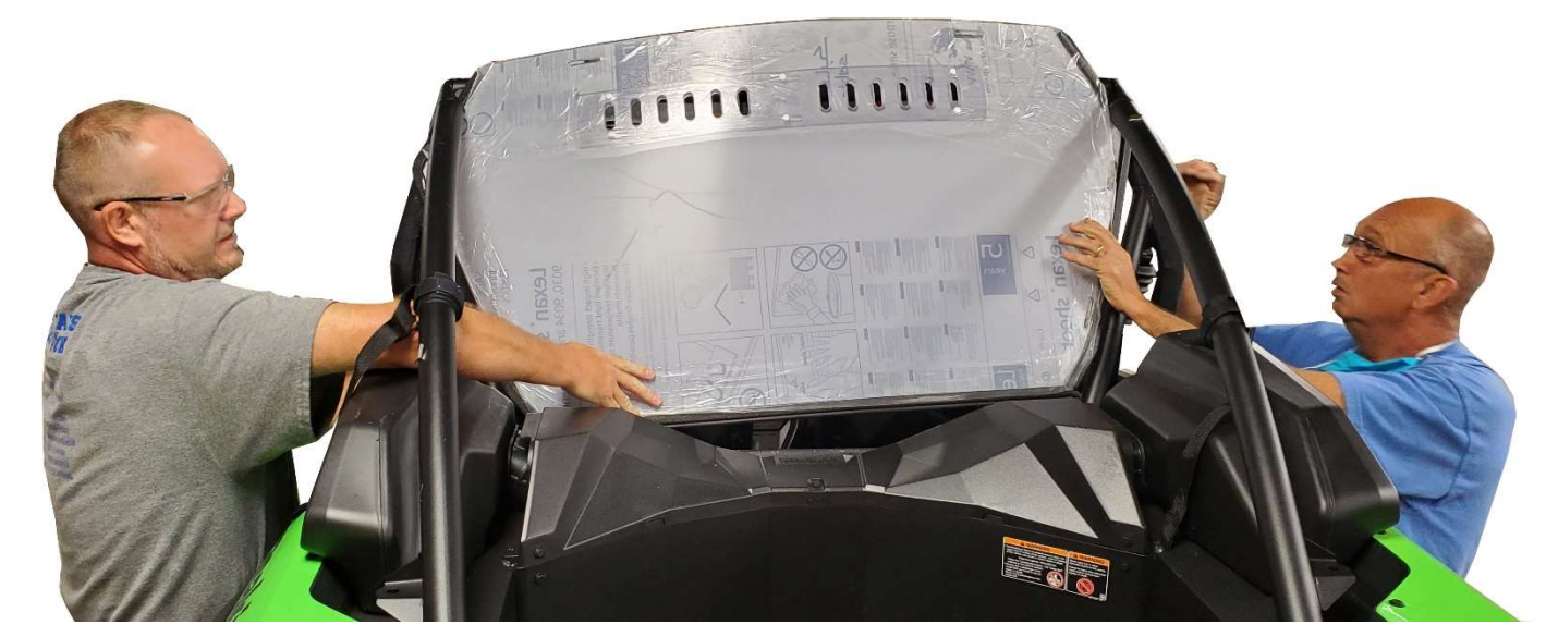
DON'T BE AFRAID TO BEND THE BACK PANEL, YOU WILL NEED TO BEND IT QUIET A BIT TO GET THE BACK PANEL IN BEHIND THE BED. WHEN YOU GET THE BACK PANEL OVER THE BED IT SHOULD FIT PERFECTLY ON THE MIDDLE ROLL BARS.