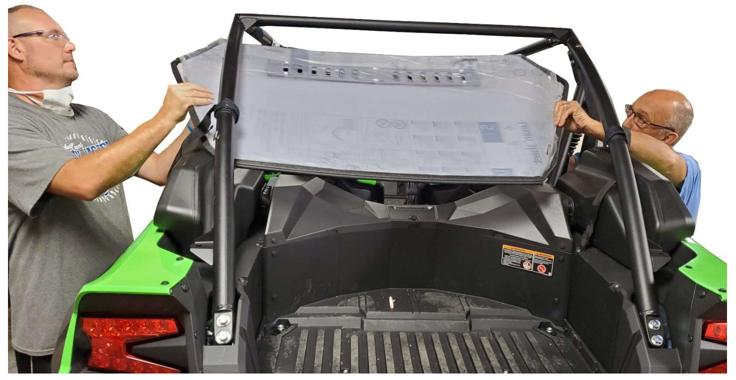
SLIDE LEXAN BACK PANEL BETWEEN MIDDLE AND BACK ROLL BARS.

After installing the side panels you will install the lexan back panel. YOU WILL NEED ASSISTANCE!