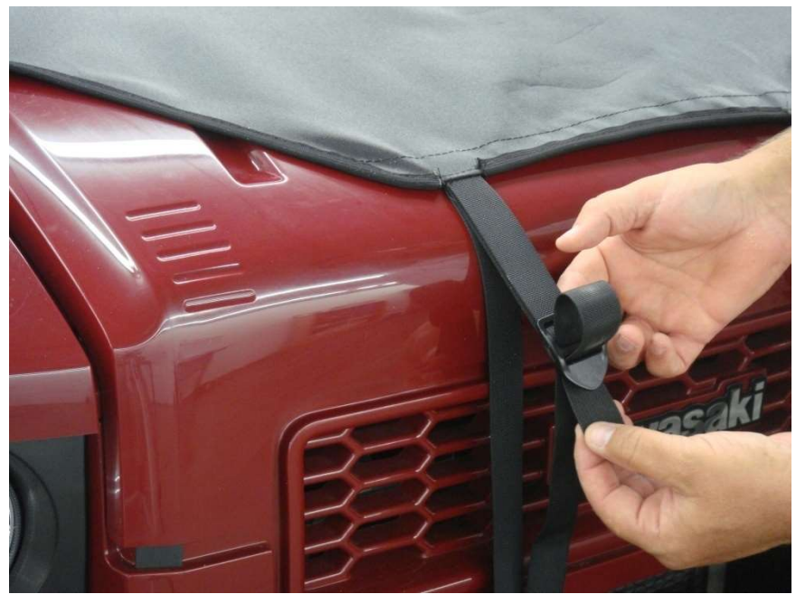
Step 7 : Repeat any steps necessary to achieve a snug fit on the cab frame.

See enclosed Product Care sheet for instructions on how to properly care for your 3SI UTV Enclosure.