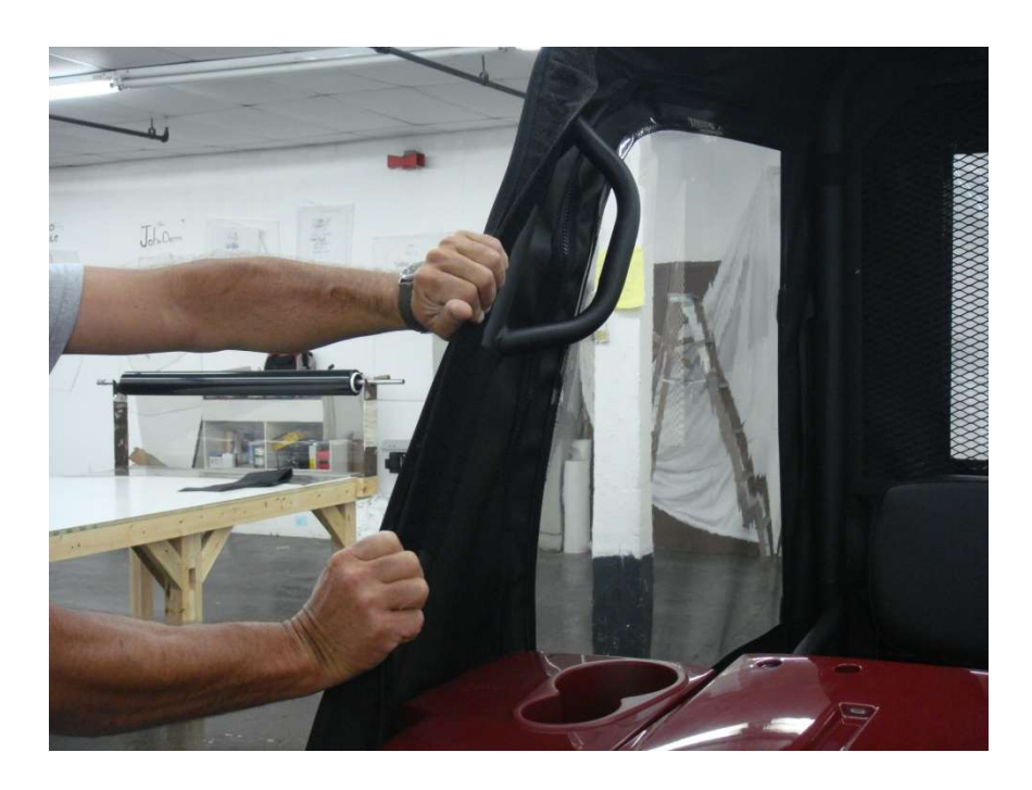
Step 7: The webbing/Velcro strip that runs the length of the front roll bars may need to be cut to accommodate the windshield clamps and the grab handle. With chalk, mark the webbing strip where cuts will be made. DO NOT CUT INTO THE BINDING.