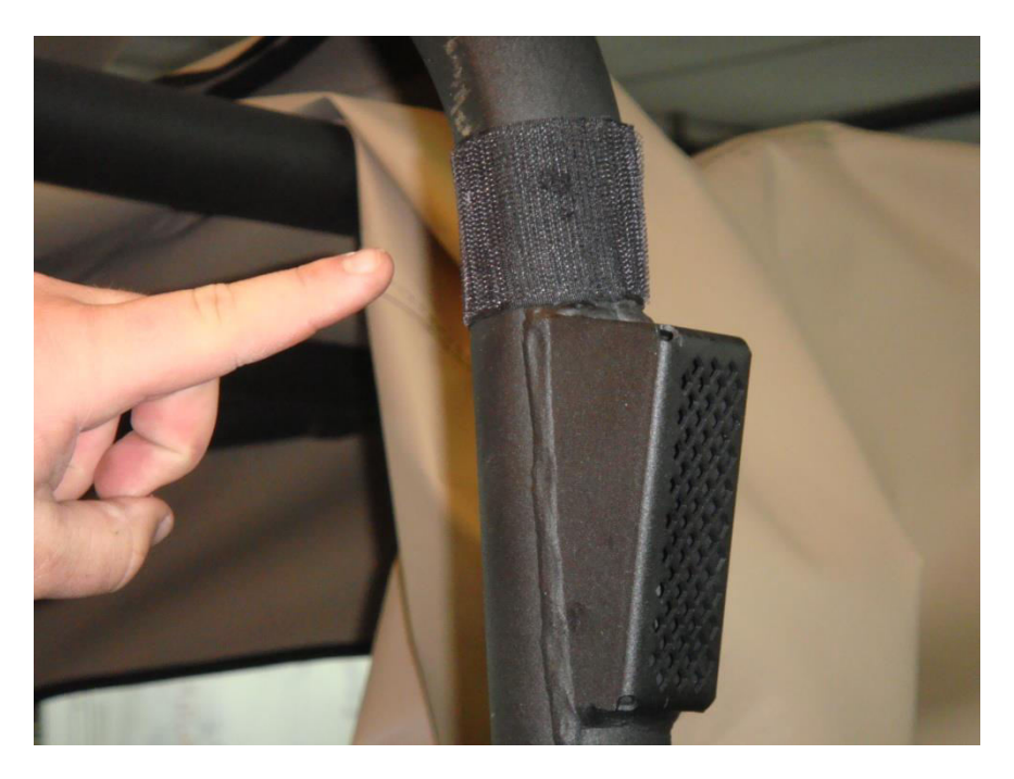
Figure 3.1 – place 6" Velcro strips horizontally around the rear Roll Bar post uprights just above the exhaust port