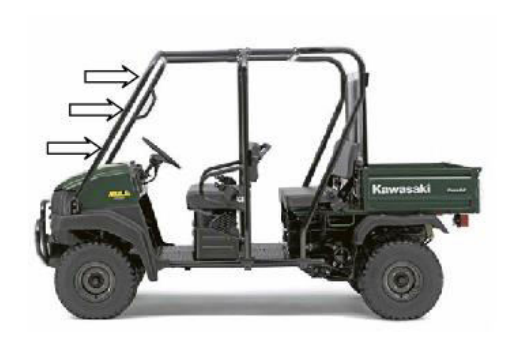
Step 3: Remove the clear plastic backing from the Velcro strip and fasten one 6" Strip horizontally around each rear roll bar frame post upright immediately above the roll bar exhaust vent as shown in figure <b>3.1 . Note: Velcro should make a complete circle around the roll bar placing the Velcro Seam toward the cab interior.