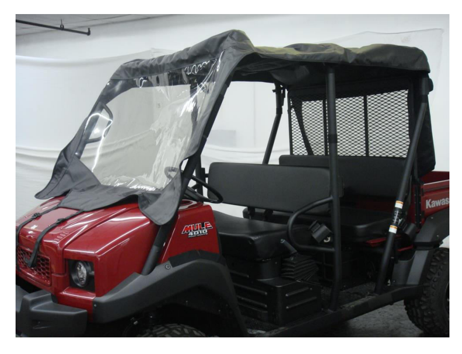
Figure 5.1 - Place enclosure loose on vehicle Cab Roll Bar Structure - Hood Straps to the front of the vehicle

Step 5: Place the Windshield / Top Enclosure on top of the Roll Bar Cab Frame as shown in figure 5.1 and adjust so that enclosure seams are located near the center of the Roll Bars. Correct orientation is with enclosure hood straps in the front of the vehicle.