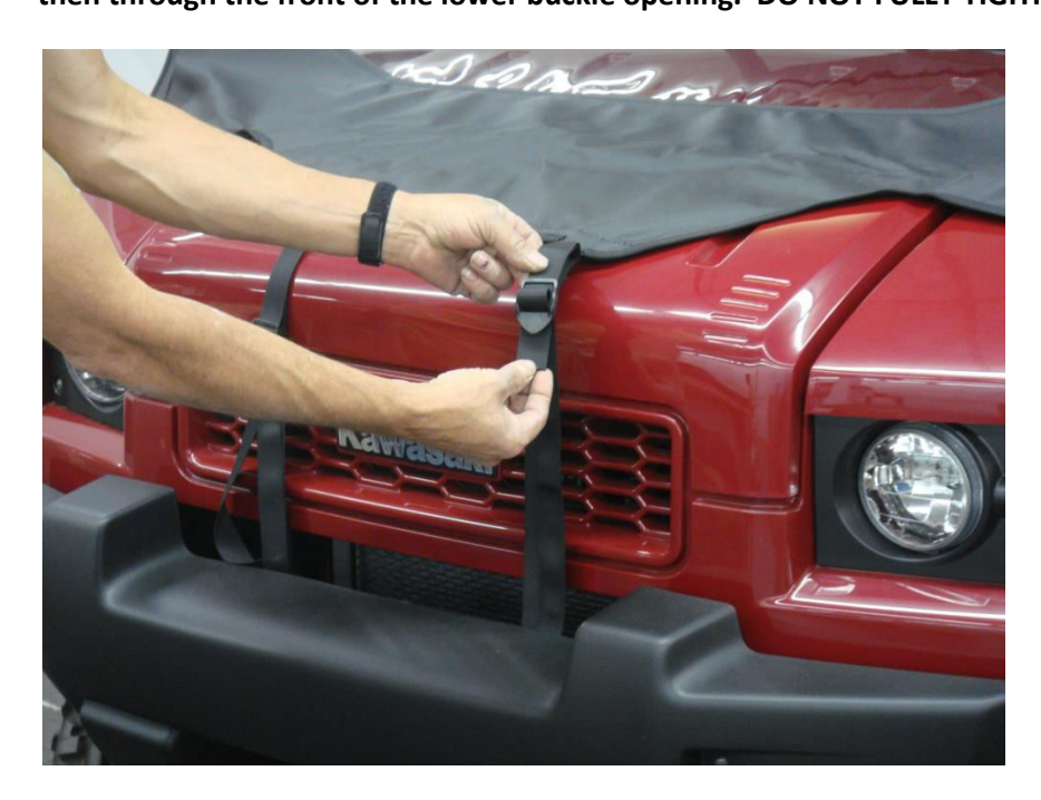
Figure 7.1 - run hood straps around the vehicle bumper and then latch through the buckle – secure but do not Fully Tighten at this time

Step 7: Fasten pre-attached Enclosure Front Hood Straps around the Vehicle front bumper as shown in figure 7.1. Bring the end of the straps up to the latch buckle, run the end through the back of the top buckle opening first and then through the front of the lower buckle opening. DO NOT FULLY TIGHTEN FRONT HOOD STRAPS AT THIS TIME.