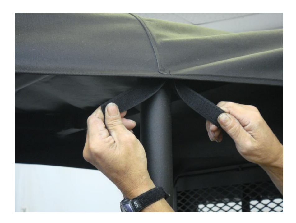
Figure 6.2 - attach Center Roll Bar Post upright Velcro tabs around installed Velcro strips