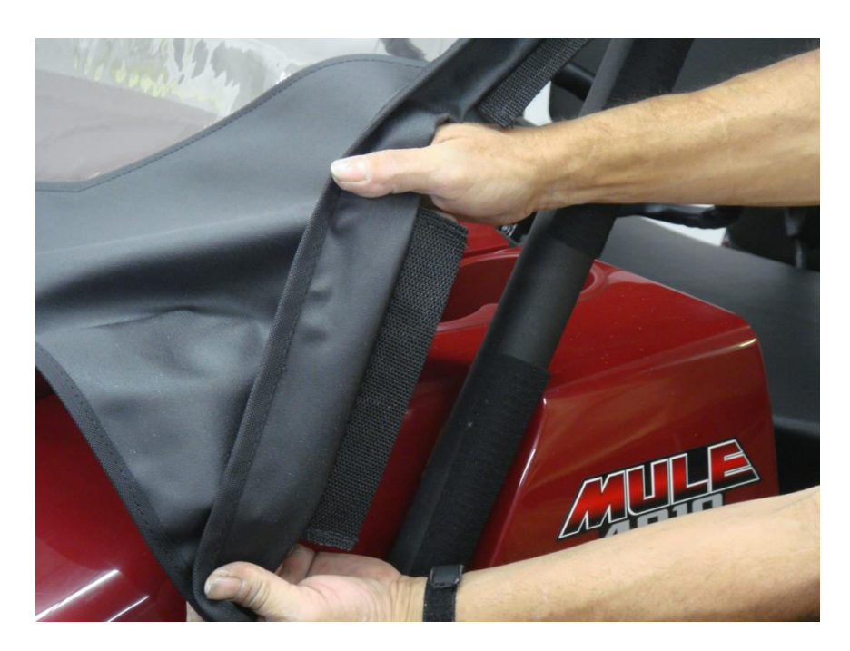
Figure 8.3 - attach lower front Roll Bar Velcro Tab pulling outward and downward toward the front of the vehicle

Step 9: Fully Tighten Front Hood Straps by pulling downward from the buckle on both strap ends at the same time as shown in figure 9.1. Tighten both straps simultaneously until front windshield is tight