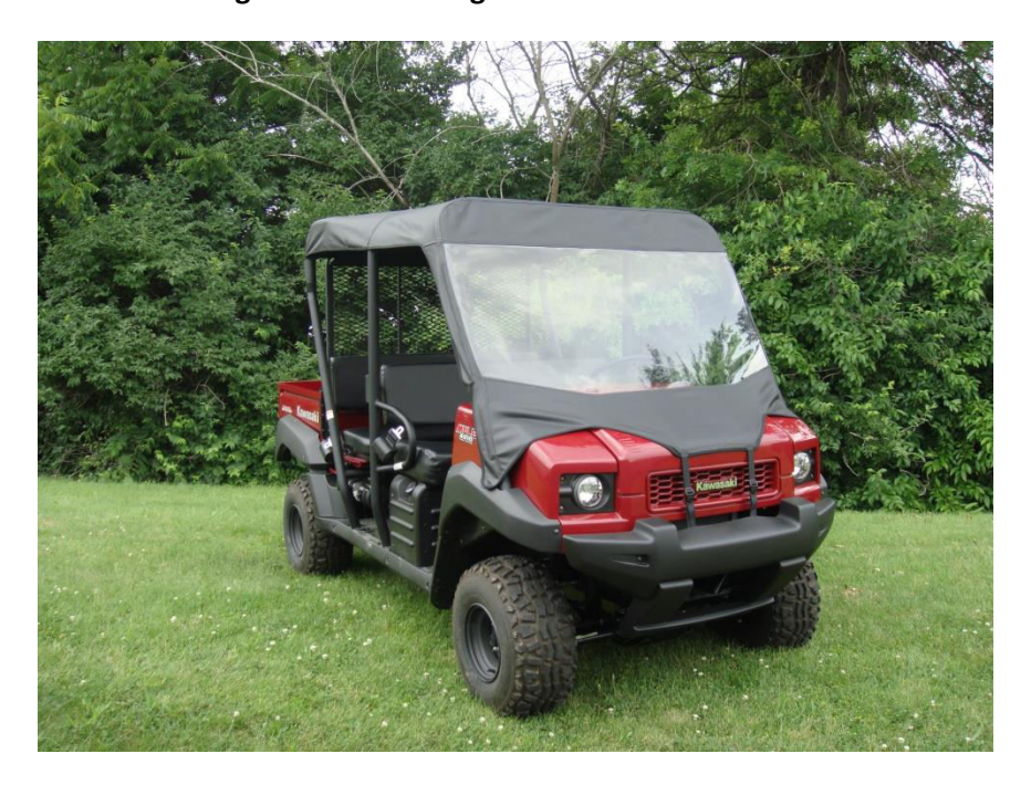
Figure 10.1 - Repeat steps 7, 9 and 10 to fully tighten windshield and cab enclosure

Step 10: Repeat any steps necessary until the Enclosure fits snug to the Vehicle Roll Bar structure and front windshield is tight as shown in figure 10.1