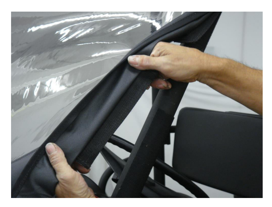
Figure 8.2 - attach middle front Roll Bar Velcro Tab pulling outward and downward toward the front of the vehicle