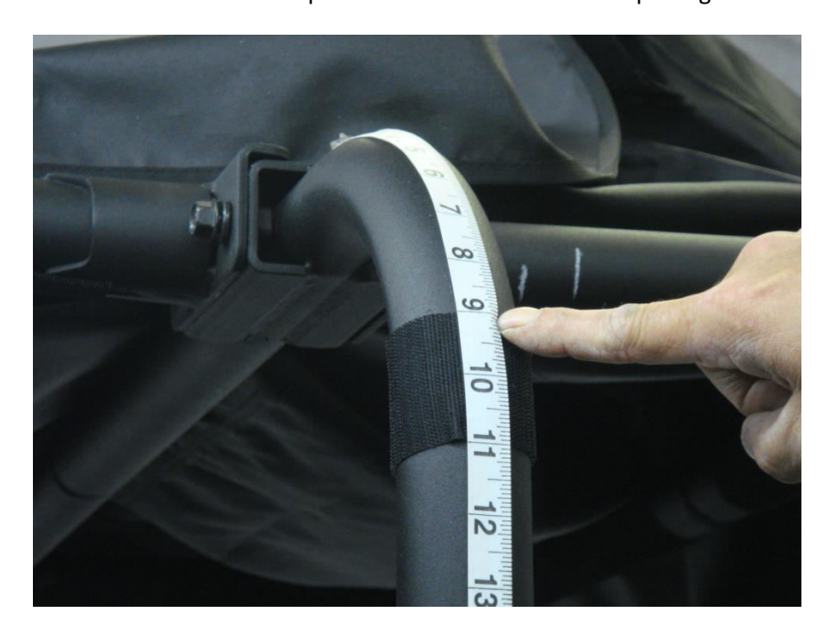
Figure 4.1 - install 6" Velcro strips horizontally 9" below top Roll Bar cross-member connecting bracket

Step 4: Remove the clear plastic backing from the Velcro strip and fasten one 6" Strip horizontally around each Center Roll Bar frame post upright 9 inches below the top cross-member connecting bracket as shown in figure 4.1. Note: Velcro should make a complete circle around the roll bar placing the Velcro Seam toward the cab interior.