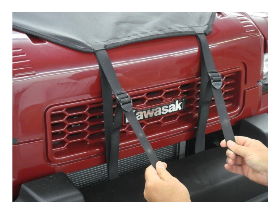
Figure 9.1 – fully tighten hood straps by pulling downward on both straps at the same time until front windshield is tight

Step 10: Repeat any steps necessary until the Enclosure fits snug to the Vehicle Roll Bar structure and front windshield is tight as shown in figure 10.1