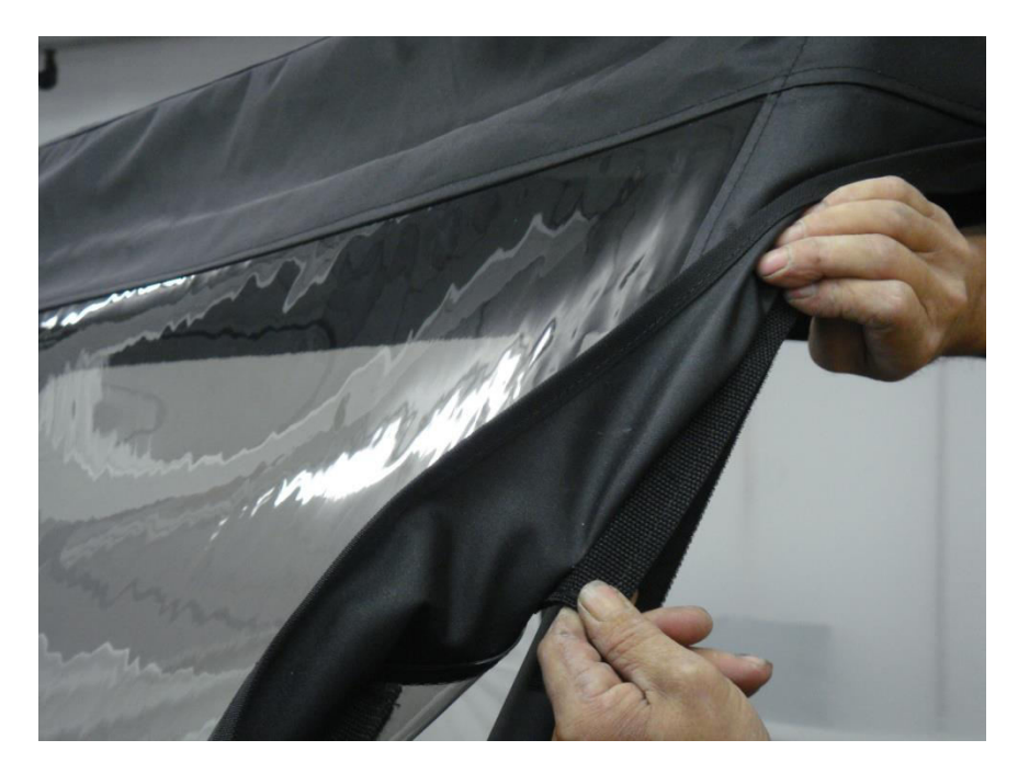
Figure 8.1 – attach top front Roll Bar Velcro Tab pulling outward and downward toward the front of the vehicle

Step 8: Starting with the top Front Roll Bar Post Enclosure tabs pull outward and downward attaching tabs to installed 8" inch Velcro Strips on the Front Roll Bar as shown in figure 8.1. Repeat this process with the lower Front Roll Bar Enclosure Tabs as shown in figure 8.2 and 8.3 making sure that the Windshield is centered between the Roll Bar posts. NOTE: This step is best performed with two installers attaching opposite windshield tabs simultaneously.