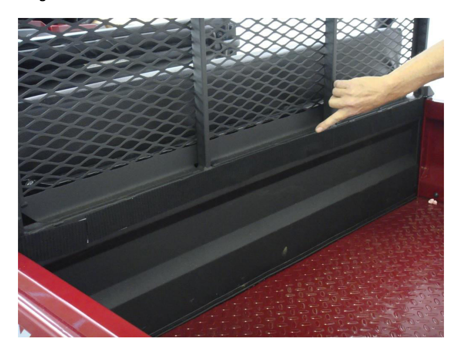
Figure 2.1 - install 46" Velcro Strip on Top Raised Panel below rear window