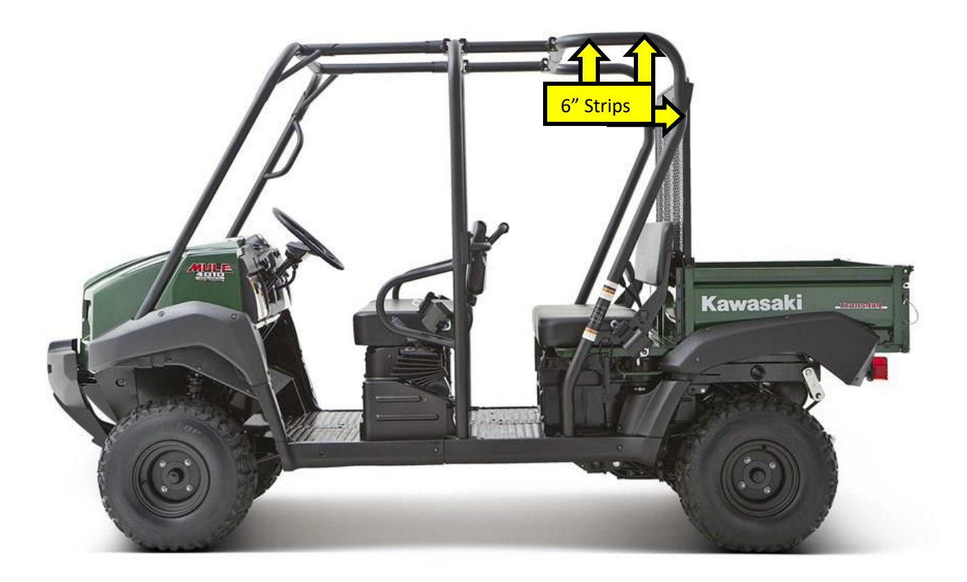
Step 3: The rest of the velcro is applied as follows to line up with the sewn in velcro on the enclosure.